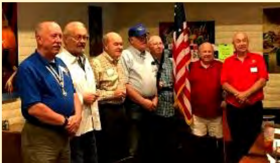
Kern Chapter members receiving their Vietnam pins on Oct 14, 2017.