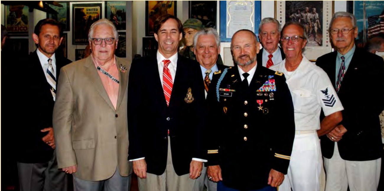
Members of the General Patton Chapter