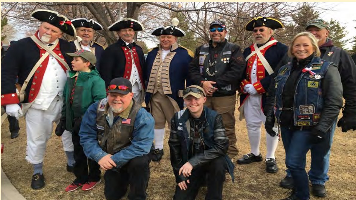
COSSAR compatriots and the CO Patriot Guard, who provided the flags.