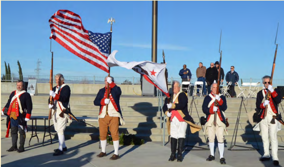
WAA at the Sacramento Valley National Cemetery