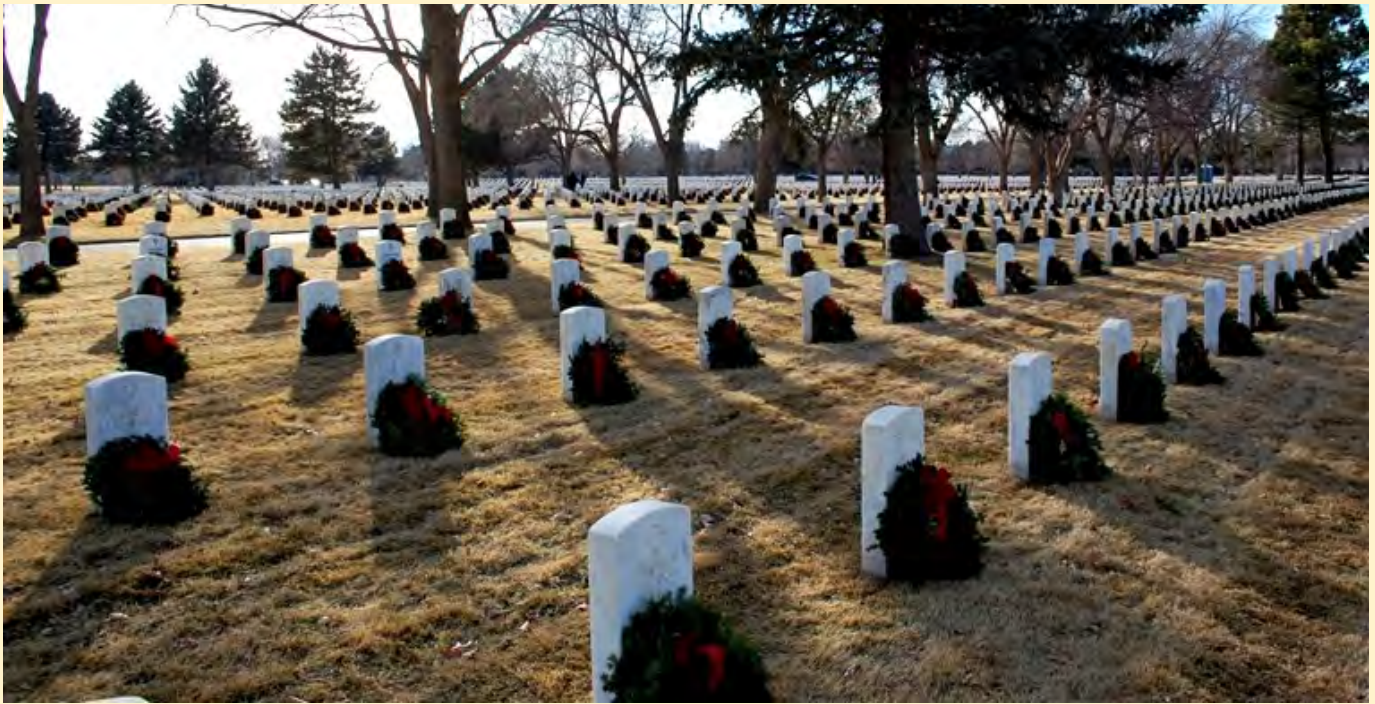
Fort Logan with wreaths in place