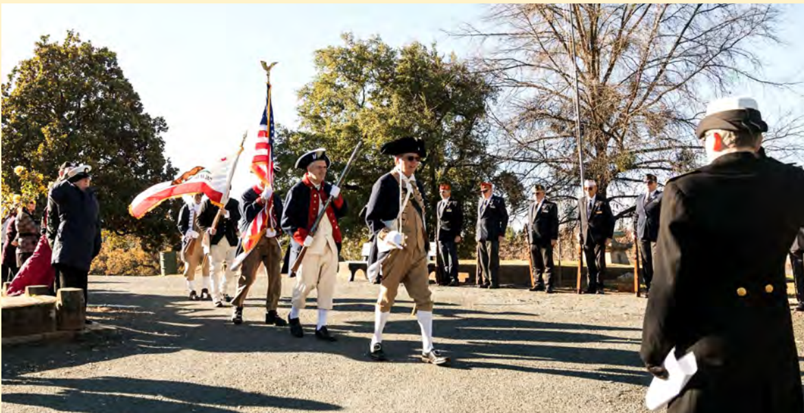
Marching in with the Colors