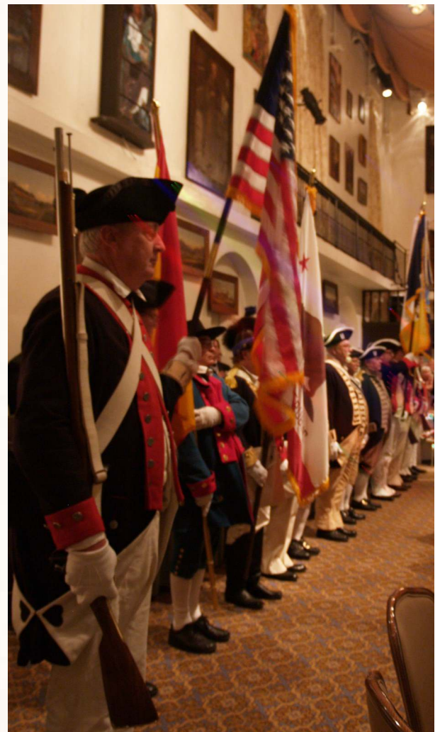
California Color Guard at closing ceremonies