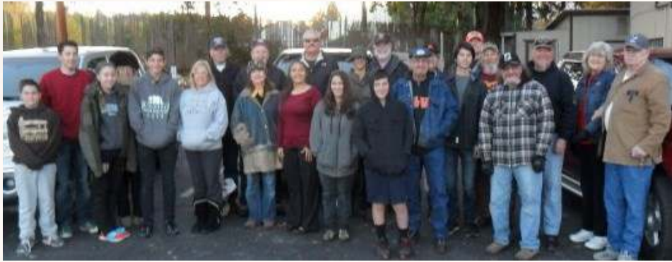
Mother Lode Chapter at Veteran's Day Event in Placerville