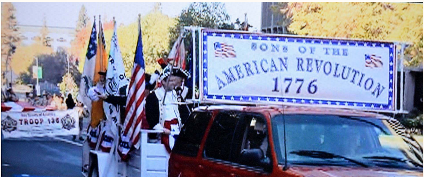
Sacramento Chapter in the Sacramento Veterans Day Parade