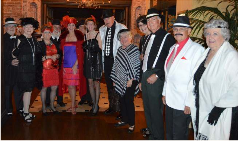
Speakeasy Revelers in lineup