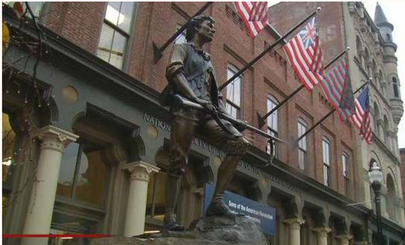
"Sons of Liberty - 1775" statue in front of SAR Headquarters

place the Sons of Liberty Statue in front of the headquarters building, but approval should be soon. Potential liability from the city damaging our sewer line was discussed, as well as construction on the electrical panel and second floor.