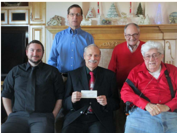
Redding Chapter throws down a Challenge. They have donated $2,000 to the SAR Foundation.