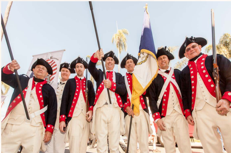
Santa Barbara Chapter Members at Veteran's Day Parade