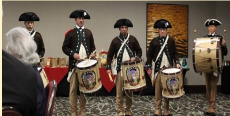
Members of the Los Angeles Fifes and Drums