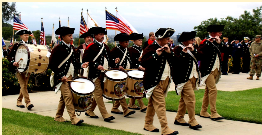
Los Angeles Fifes & Drums