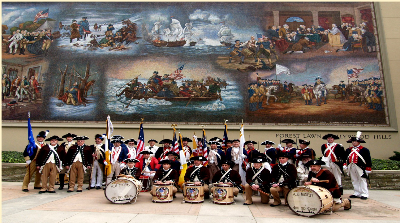
CA Society SAR Color Guard and the Los Angeles Fifes & Drums