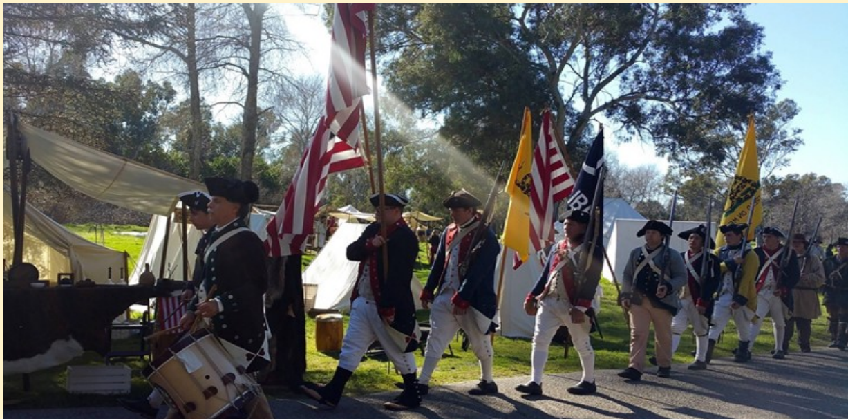
The Continentals return from the battlefield.