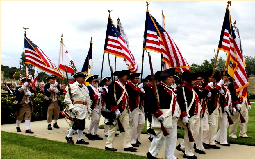
First group Orange County Color Guard , 2nd group Riverside Color Guard, 2nd group Kern Color Guard and 4th group General George Patton Color Guard