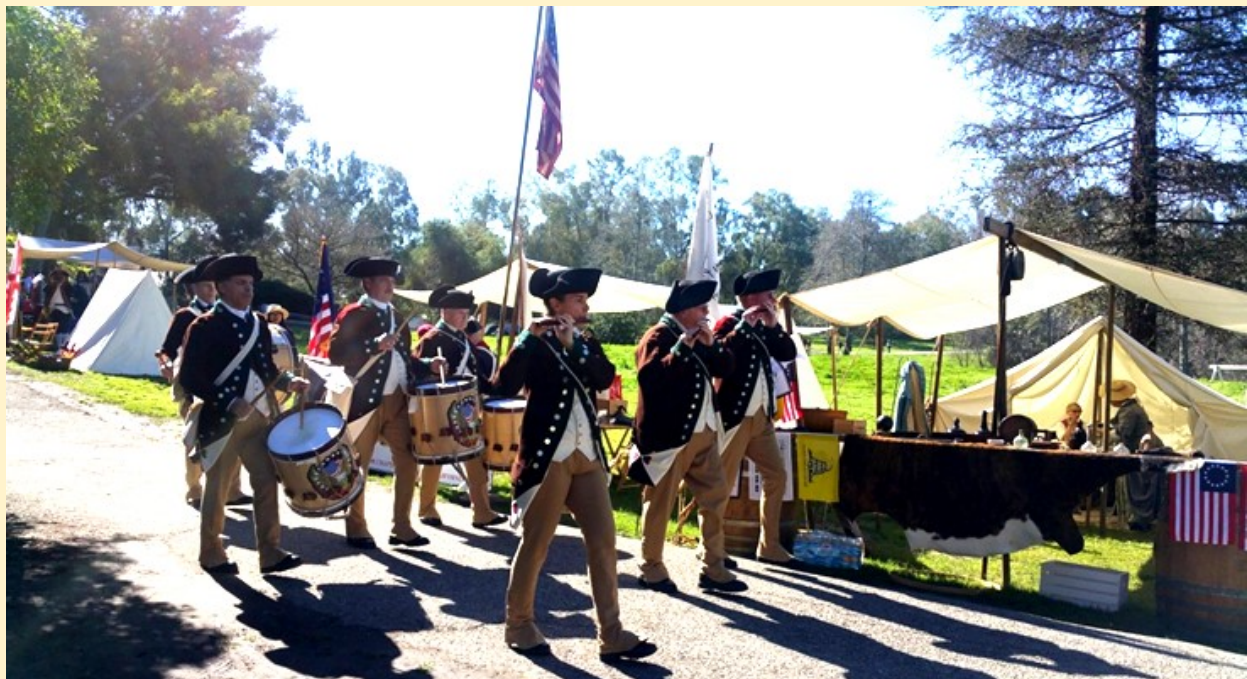
The Los Angeles Fifes & Drums move toward the battle .