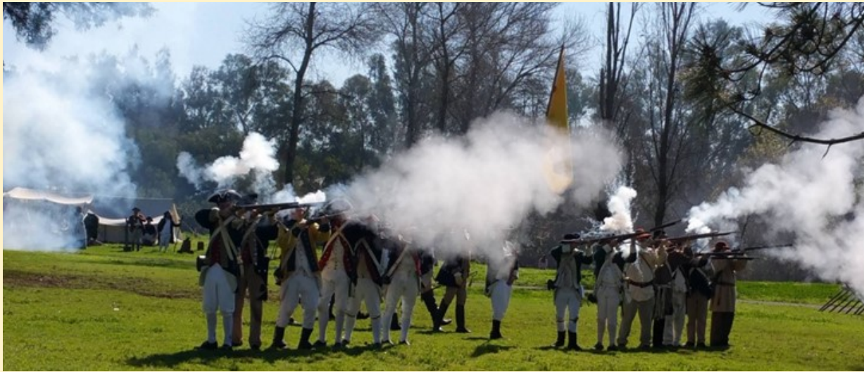
The Continentals and British engage one another