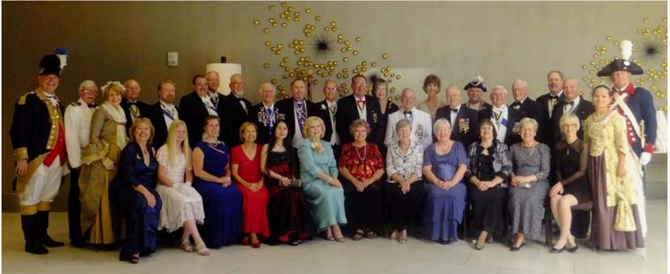
CASSAR members at 2014 national Congress