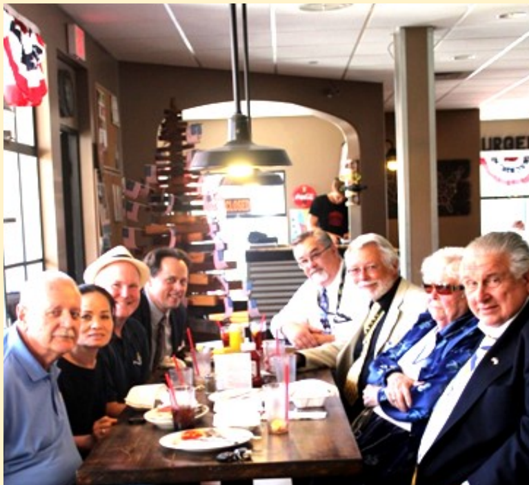
Between visits to Mission La Purisima Concepcion and Mission Santa Inés, members of the Santa Barbara Chapter gathered at Chomp restaurant in Solvang for lunch.