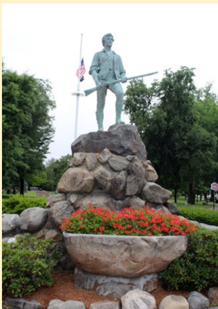
Captain Parker statue

On Saturday morning, July 9, we boarded buses for the battlefield tour. We went to the Lexington Green, and were led on a walking tour of the area. We saw the Captain Parker statue, given to the town of Lexington in 1899, and the site of the first three meeting houses in Lexington (built in 1692, 1713 and 1794). We saw the site of the Old Belfry, from which was rung the alarm on April 19, 1775. We saw the monument erected in 1799 memorializing the martyrs at Lexington in 1775. We ended our walking tour at the historic Buckman Tavern, built around 1709, and headquarters of the Lexington militiamen in 1775. We had a boxed lunch at the Lexington Historical Society.