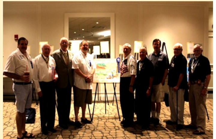
Above photograph: The middle poster "The Henry Knox Extraordinary Cannon Trail" sponsored by the Gold Country Chapter, California Society.