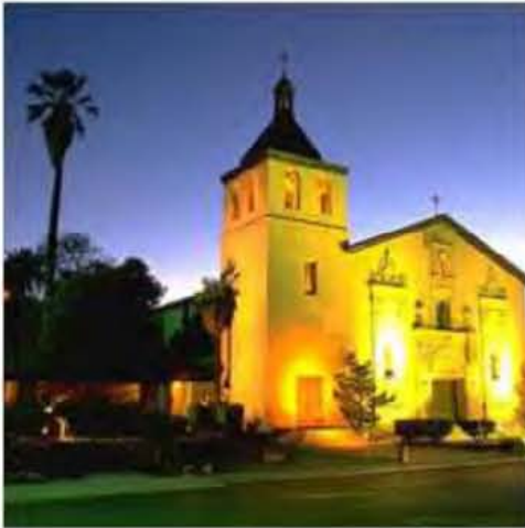
Embassy Suites Santa Clara-Silicon Valley

EMBASSY SUITES SANTA CLARA-SILICON VALLEY 2885 LAKESIDE DRIVE, SANTA CLARA, CA 95054 CALL 408-496-6400 FOR HOTEL RESERVATIONS