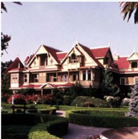
Visit local attractions such as the Winchester Mystery House.