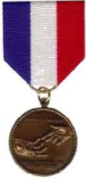
The Service to Veterans Medal may be awarded to SAR members who have given long and exemplary service to veterans. The medal is awarded for 5000 USS Stark Award points accrued by an SAR member.

• The CASSAR Secretary will serve as the Committee Chairman.