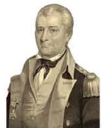
Fort Laurens, the only Revolutionary War fort in the State of Ohio, was built by order of General Lachlan McIntosh in 1778.