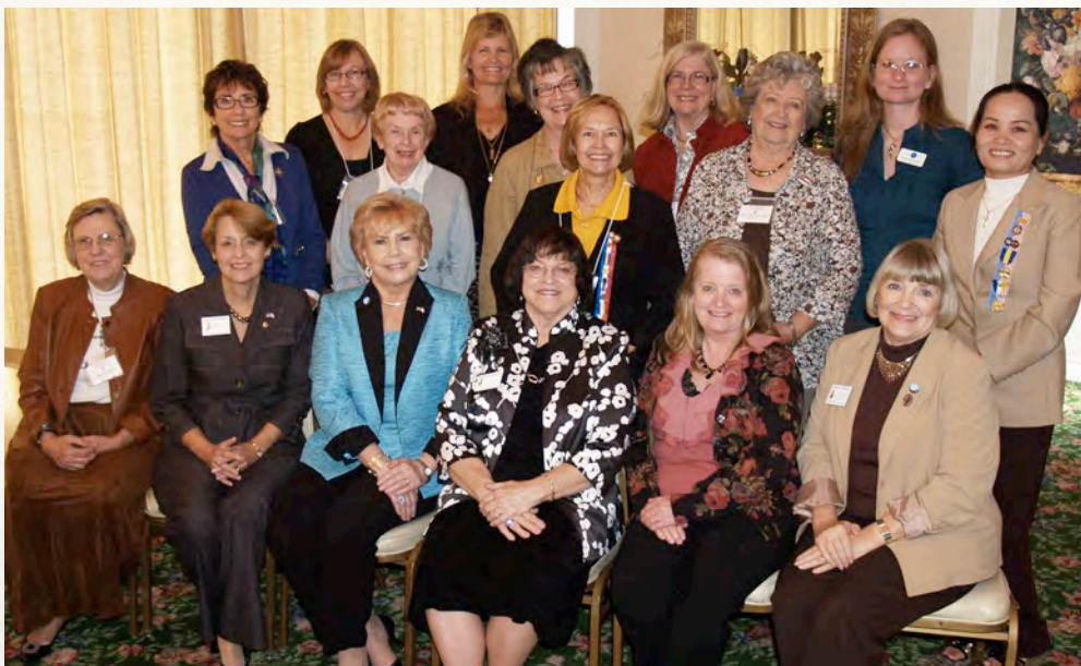
The remarkable members of the CASSAR Ladies Auxiliary at the Fall Board of Managers Meeting in San Diego