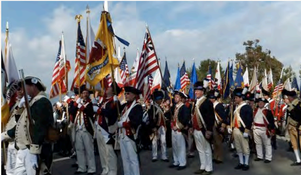
Color Guards from South Coast, Orange County, Redlands, and Riverside chapters assemble at the Massing of the Colors in Burbank, sponsored by the Sons of Liberty Chapter