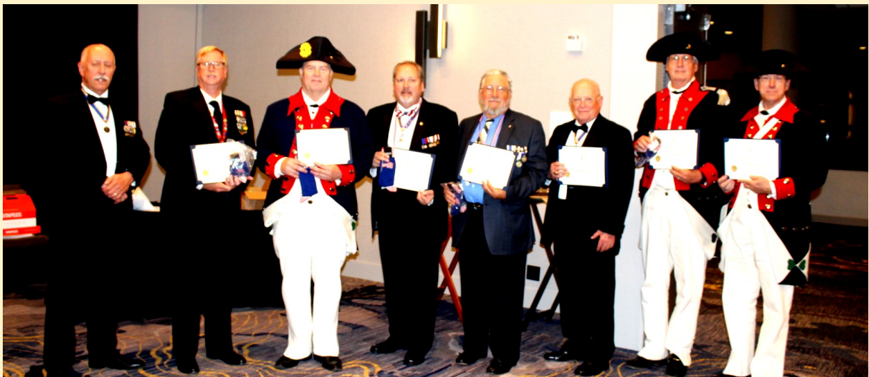
The Committee chairmen were introduced and thanked for their service.