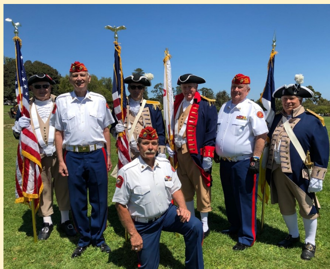
Gen. Patton Color Guard with members of the Marine Corps League.