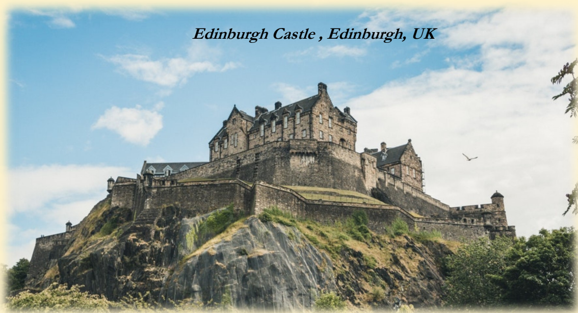
Edinburgh Castle, Edinburgh, UK