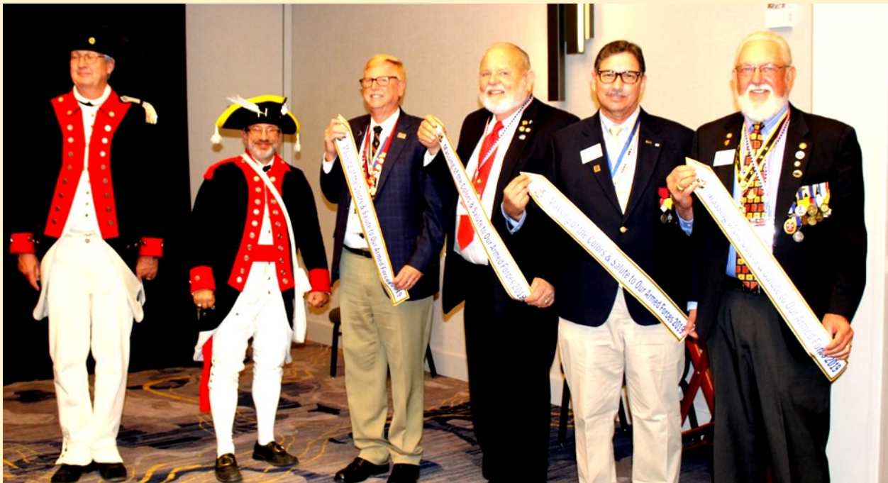
Massing of the Colors streamers went to Eagle, Patton, Harbor, Orange County, Redlands, and Riverside Chapters.