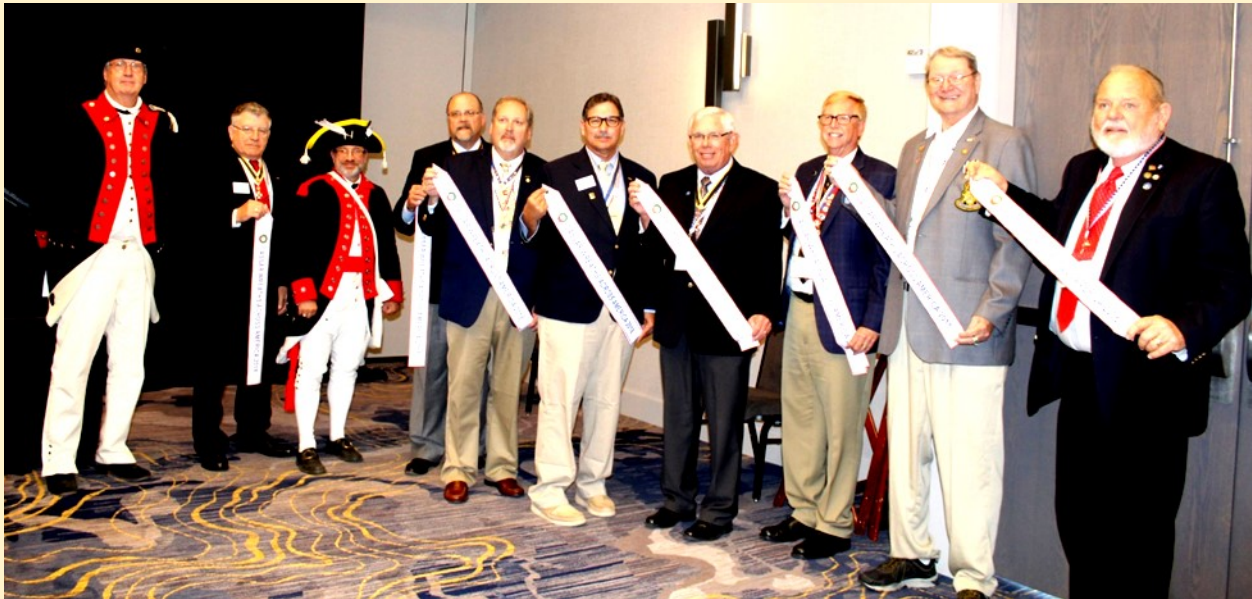
Wreaths Across America streamers presented to Central Coast, General George Washington, Gold Country, Harbor, Orange County, Redwood, Riverside, Sacramento, Sons of Liberty, and Thomas Jefferson Chapters.