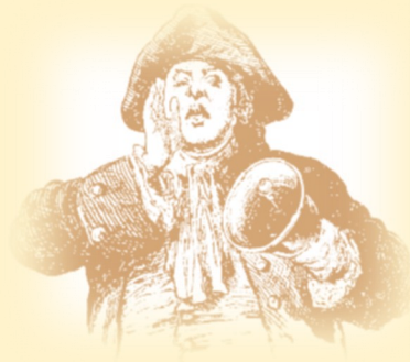
The banquet was adjourned at 10:05pm.