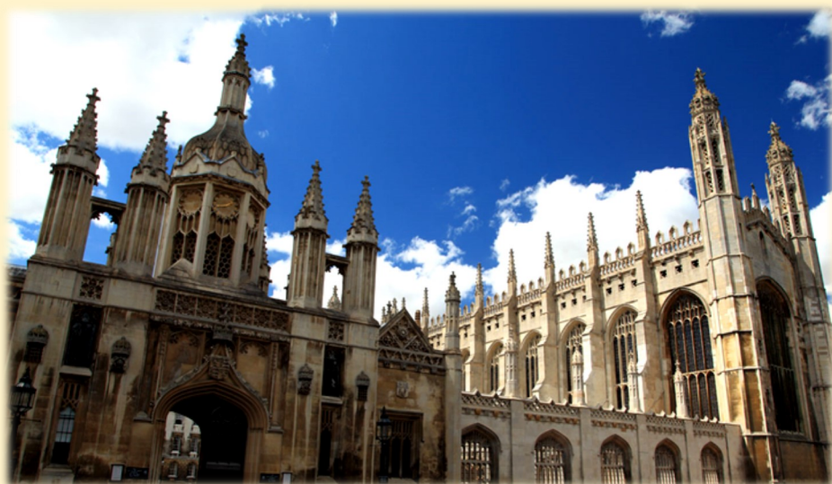
Kings College, London

On May 21, some of us went on the post trip to London. We took a first class Virgin West train to London, and went to King's College London. The College had documents laid out for us from the Georgian Papers , and other items of interest. Researchers discussed the project, which is supported by the Sons of the American Revolution. We had a wine and cheese reception in the adjacent room, where we had the opportunity to speak with the researchers. In London, we stayed at St. Ermin's Hotel, which was conveniently located in Westminster, just a few minutes' walk to Parliament Square, Westminster Abbey, and the Houses of Parliament.