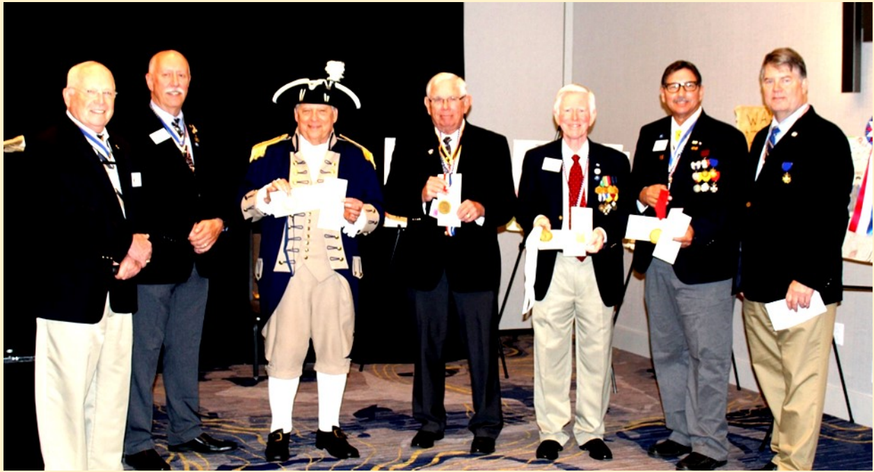
The Brochure Contest winning Chapters.