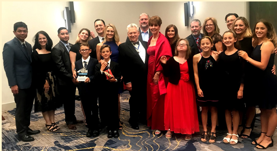
Most of my Family

Please do not overlook the support of your local DAR and CAR chapters. Where possible, attend their meetings, honor them with awards as appropriate, and include them in your social functions and chapter meetings.