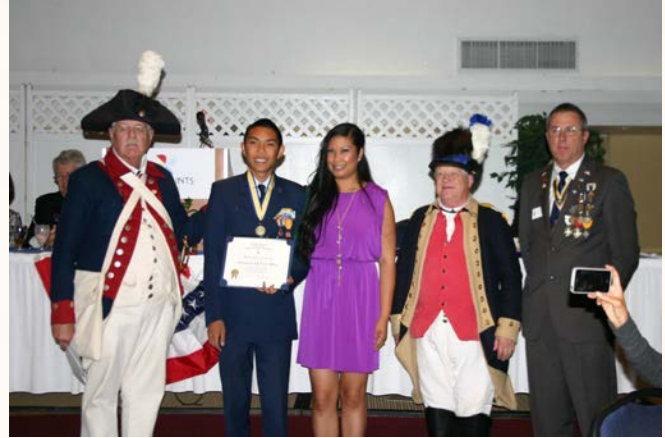
JROTC Contest Winner