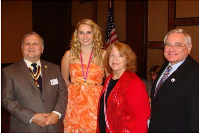
CAR Representatives at Youth Award Banquet