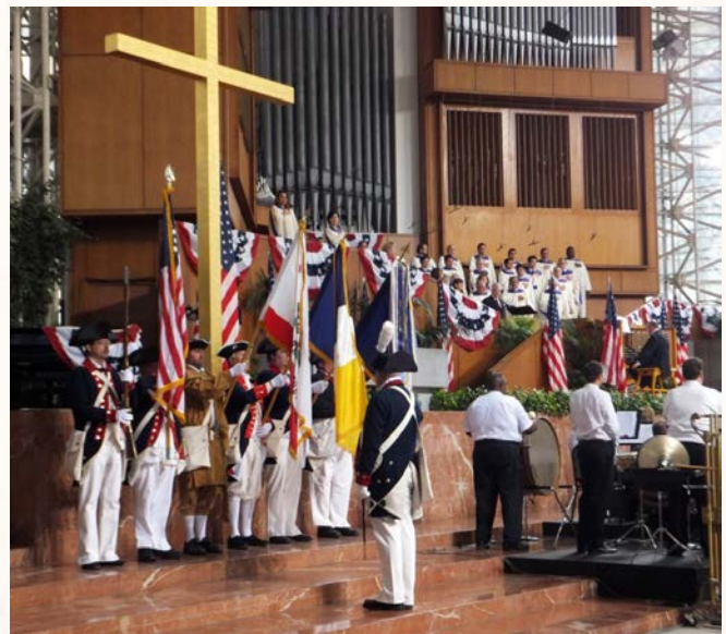
Crystal Cathedral, Memorial Day, Sunday, May 26, 2013 - presenting the Colors