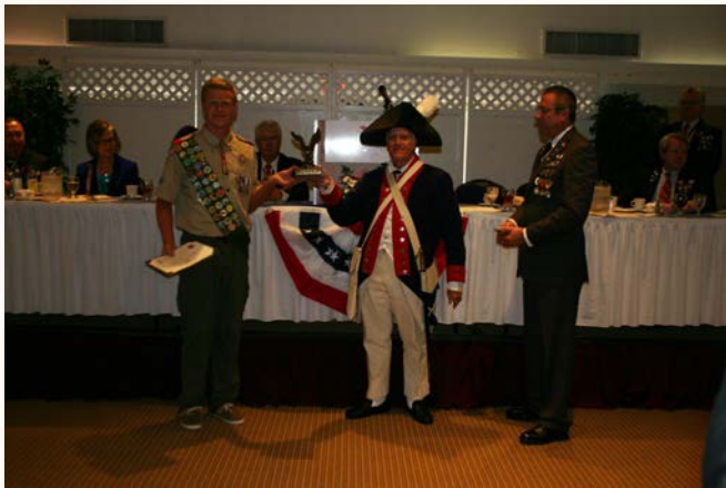
Eagle Scout Essay Contest Winner