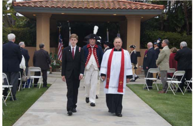
CASSAR Chaplain and CAR Chaplain at the Memorial Service