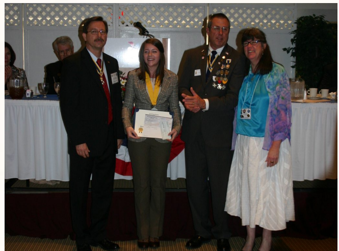
Orations Contest Winner