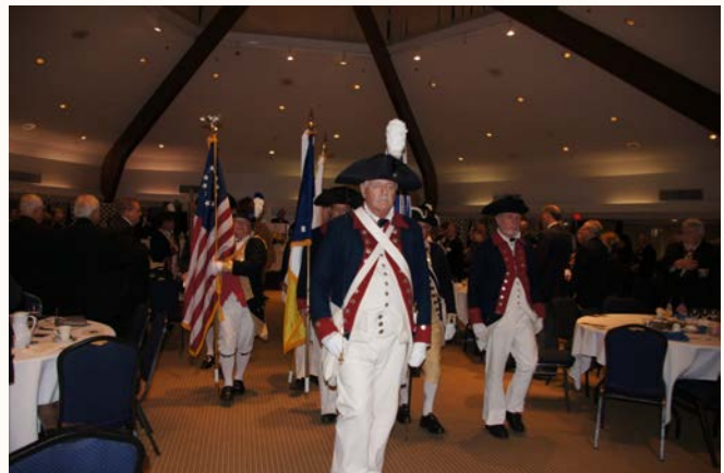
Presentation of the Colors at the Banquet