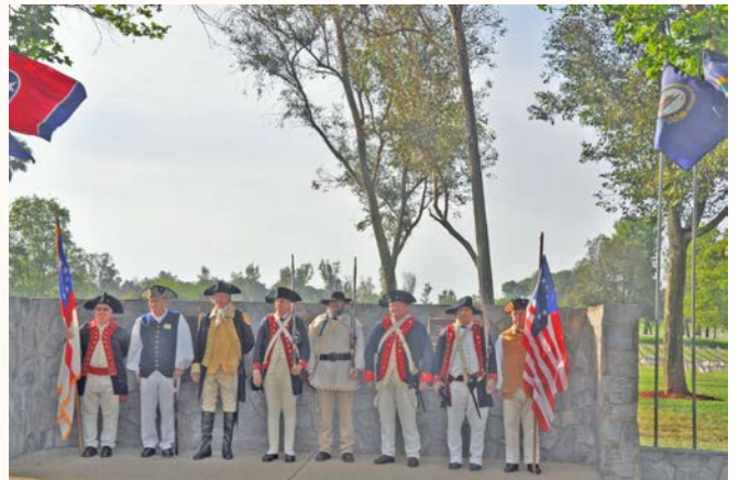
Riverside Chapter Guardsmen at the Riverside National Cemetery.

On May 27, 2013, members of the Riverside Chapter, CASSAR gathered at the amphitheater adjacent to the Medal of Honor monument at the Riverside National Cemetery to render honors to those fallen in defense of our nation. As the name of each war since our national inception was read, the number of fallen warriors was given, a bell was rung, and a musket salute was fired. This ceremony has been performed for the last ten years by the Riverside Chapter. Members of other lineage groups were in attendance including representatives of the Aurantia Chapter DAR, the Luiseno Chapter DAR, the Order of Founders and Patriots, and the DeAnza Chapter of CAR. Days earlier, Riverside Chapter CASSAR members assisted in placing American flags on graves in the National Cemetery.