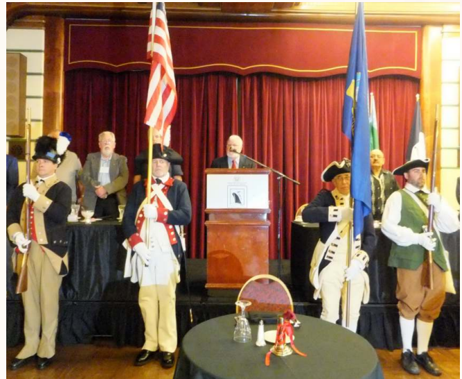
Presentation of the Colors for the USS Bennington reunion