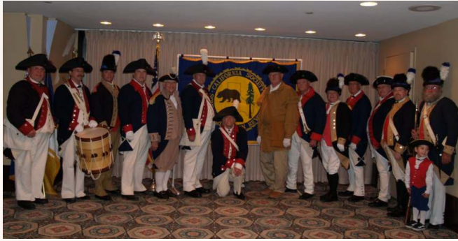
CASSAR Color Guard