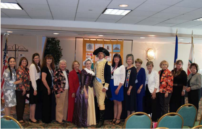
The LAUX with their speakers, George & Martha Washington