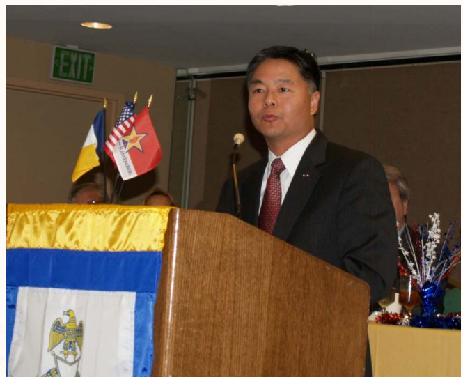
Senator Ted Lieu

State Senator Ted Lieu (who represents El Segundo) was presented with a specially framed Silver Good Citizenship Medal. Senator Lieu gave a moving speech about how he came to the United States as a boy with his parents who left everything behind. His parents worked very hard and provided Senator Lieu with a better life in America. They eventually owned a chain of gift shops, and were able to provide Senator Lieu with a quality education. He wanted to give back to America.