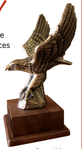
State Winner Trophy

LIST OF STATE CHAIRS, ANCESTRY CHARTS, COMPLETE RULES AND ALL FORMS CAN BE FOUND AT WWW.SAR.ORG