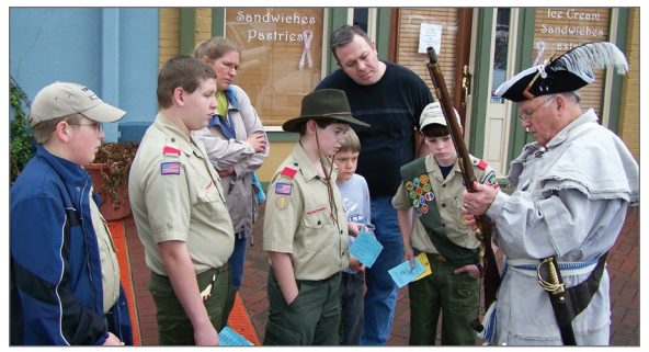
Scouts observing musket demonstration during Washington, Georgia, ceremonies.

The SAR and the Boy Scouts participate in many activities together. Scouts of all ages can help during SAR parades and ceremonies including grave markings and Revolutionary War battle ceremonies. SAR members contribute to Scouting activities by teaching relevant merit badges, such as American Heritage, Genealogy, Law, Citizenship in the Community, Citizenship in the Nation, and Citizenship in the World.