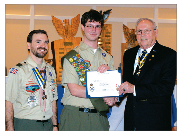
Eagle Scout Court of Honor recognition by the Sons of the American Revolution.

The SAR and the Boy Scouts participate in many activities together. Scouts of all ages can help during SAR parades and ceremonies including grave markings and Revolutionary War battle ceremonies. SAR members contribute to Scouting activities by teaching relevant merit badges, such as American Heritage, Genealogy, Law, Citizenship in the Community, Citizenship in the Nation, and Citizenship in the World.