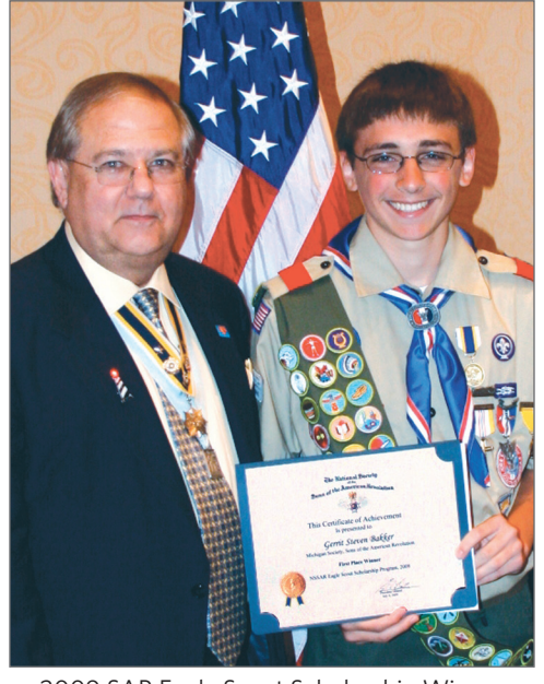
2009 SAR Eagle Scout Scholarship Winner