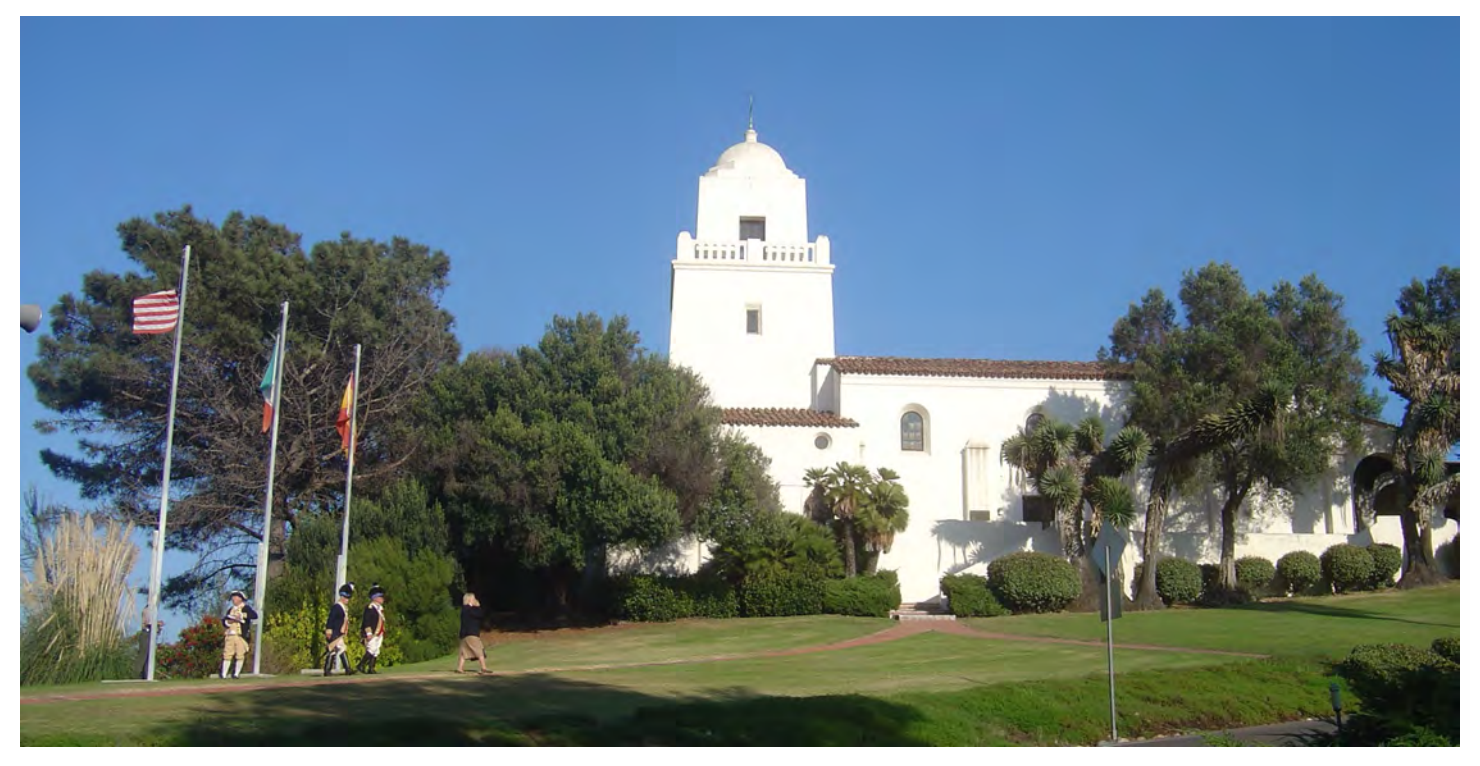
Royal Presidio of San Diego de Alcalá

On orders of José de Gálvez, the Visitador General of New Spain, in 1770, Don Gaspar de Portolá took possession of the Port of San Diego, and founded the Royal Presidio of San Diego de Alcalá on May 14, 1769, on the hill in present-day Presidio Park. The presidio was the first permanent European settlement on the Pacific Coast of what is now the United States. During the American Revolution, the presidio was commanded by Lt. José Francisco Ortega (1773-1781), and Lt. José de Zúñiga (1781-1793). In 1783, the presidio had 54 officers and men. Following the loss of New Spain to Mexico in 1821, the Spanish surrendered the presidio to Mexican officials in 1822. Mexico decided to abandon the four original Spanish presidios in 1835, and the Presidio of Sonoma (established in 1836) became the headquarters for the Mexican Army in Alta California. The presidio fell to ruins, and nothing remains on the original site. In the 1920's, the Junipero Serra Museum was built on the original site of the presidio.