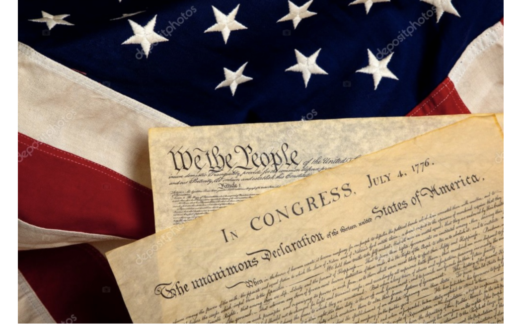
Click the image to play the America 250 SAR Video

READ THE 5 YEAR OPERATIONAL PLAN FOR AMERICA 250