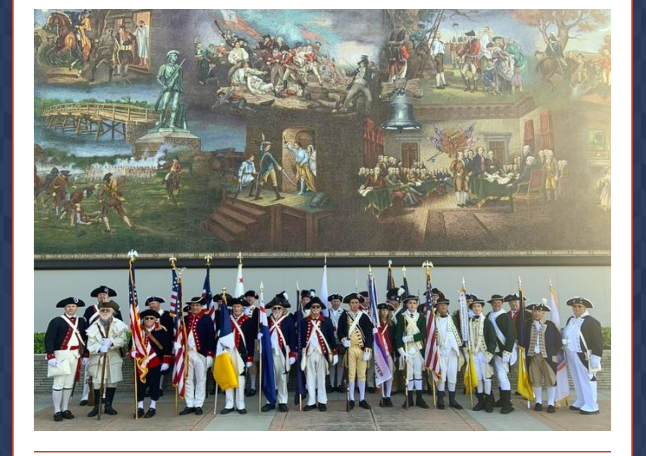
South Coast Color Guard Members Attending Massing of the Colors