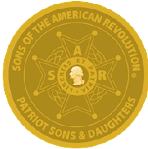
SAR PATRIOT SONS & DAUGHTERS 3" bronze finish medallion