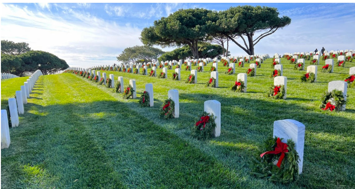
Fort Rosecrans National Cemetery