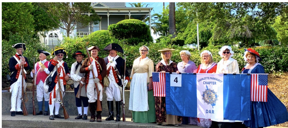
Parade participants of the Sacramento Chapter SAR and Charlotte Parkhurst Chapter DAR

Color Guard members from the Sacramento and Mother Lode Chapters participated in Historic Folsom's Hometown Parade along with ladies from the Charlotte Parkhurst Chapter DAR. The parade covers four blocks, downhill, totaling 1/2 mile, bordered by a pumped-up and cheering crowd of thousands.