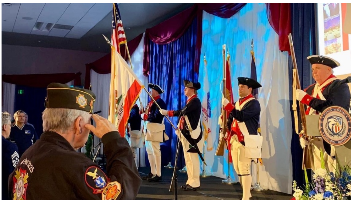
Color presentation for the Clovis Veterans Memorial District dinner