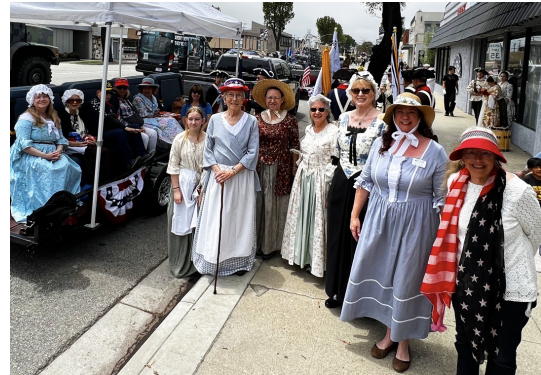
Ladies of the Daughters of the American Revolution and others

Here is a list of participating chapters.