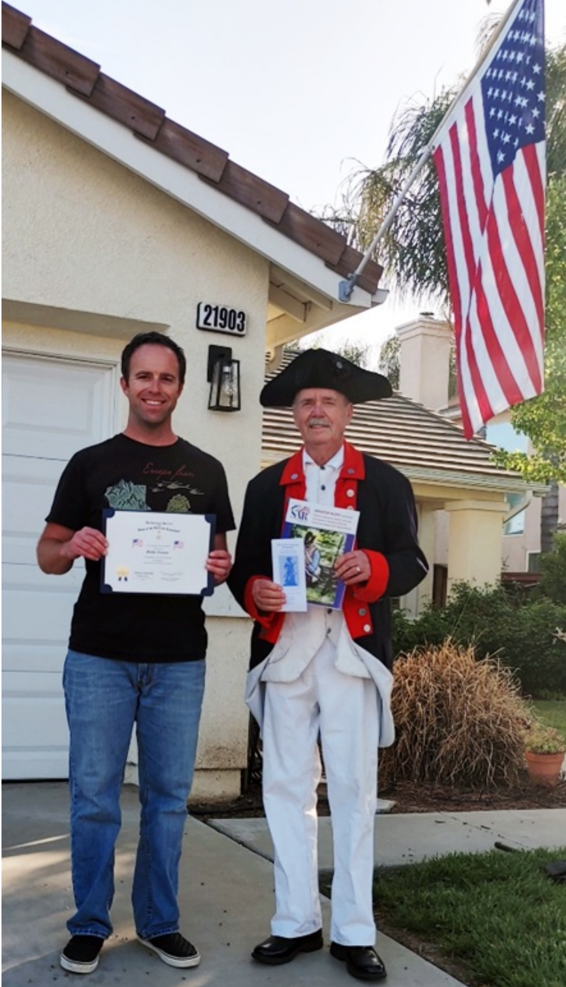
Needing a few SAR Chapters to step up to the plate and deliver SAR Flag