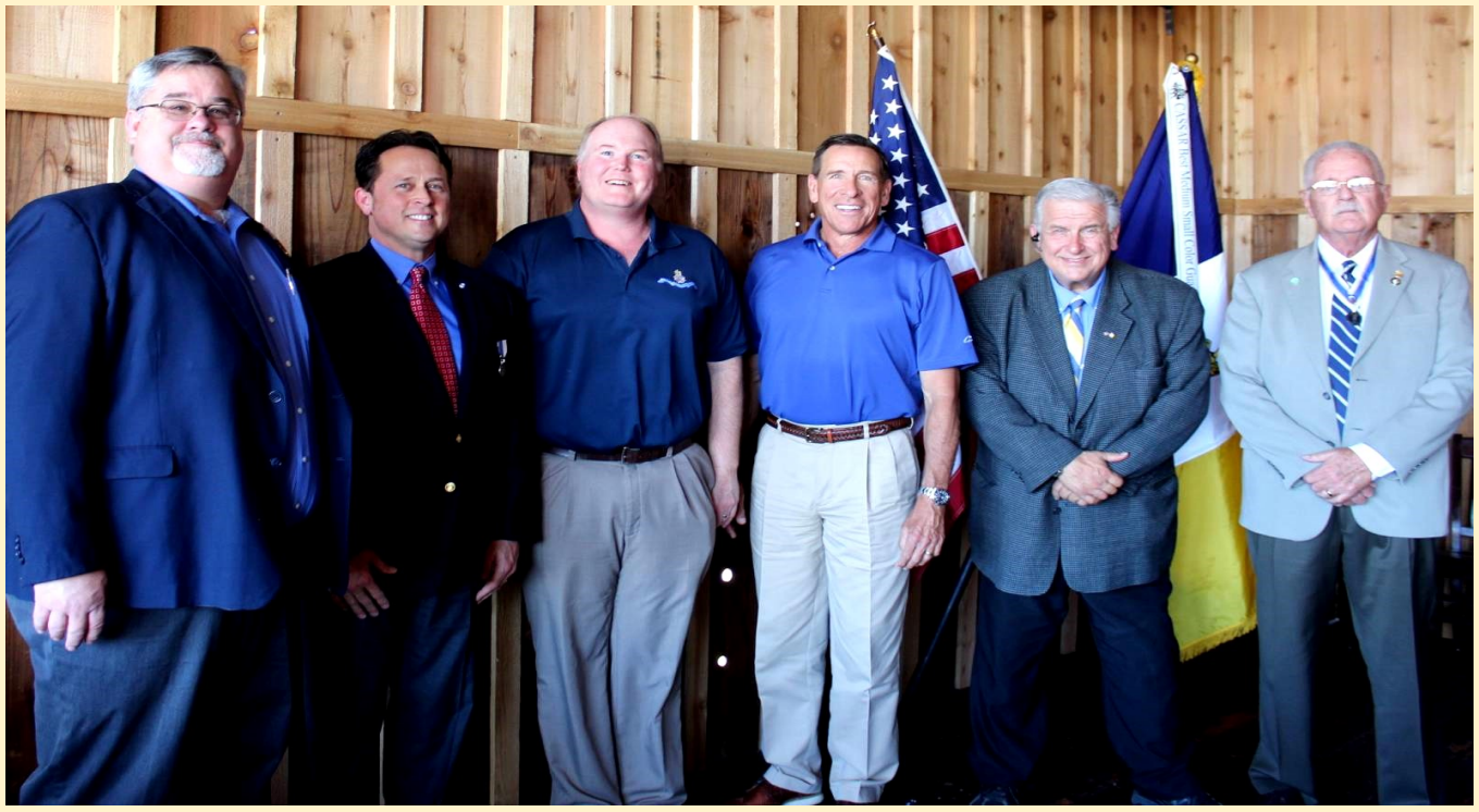
Santa Barbara Chapter Officers