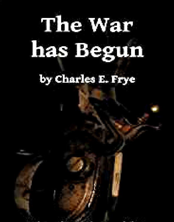
Book One of Duty in the Cause of Liberty

The War has Begun is available as a paperback edition in bookstores and from CreateSpace and Amazon, where aKindle edition is also available. The author can be reached via his website: https://dutyinthecauseofliberty.wordpress.com/.