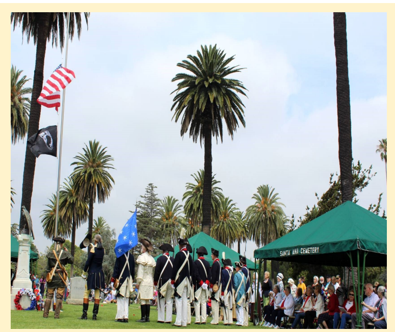
Orange County and Harbor Chapters Color Guardsmen place a wreath at the Civil War Monument