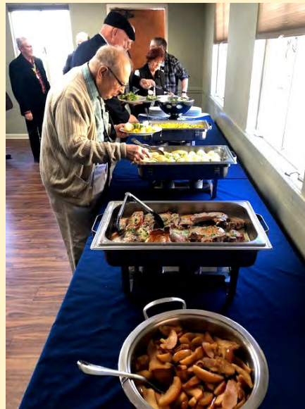
View of the buffet table