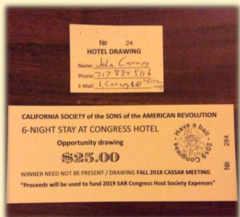
Winning ticket for free room at the CA Congress