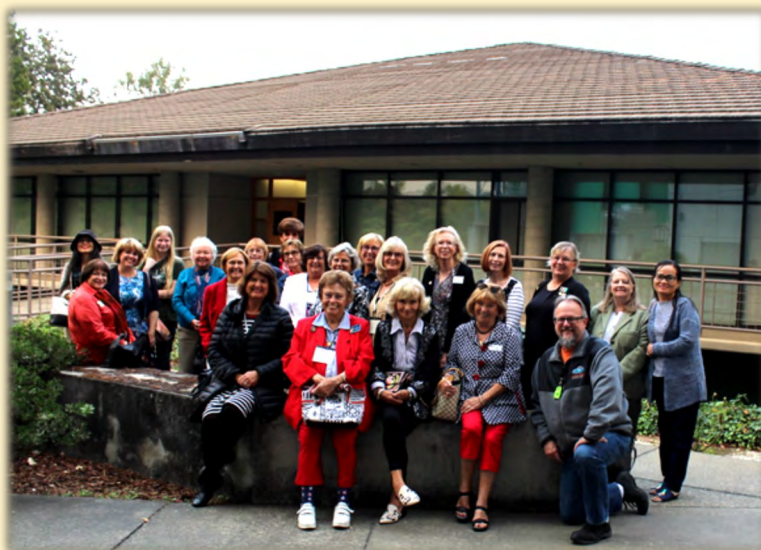
The ladies at the Gekkeikan Sake Brewery