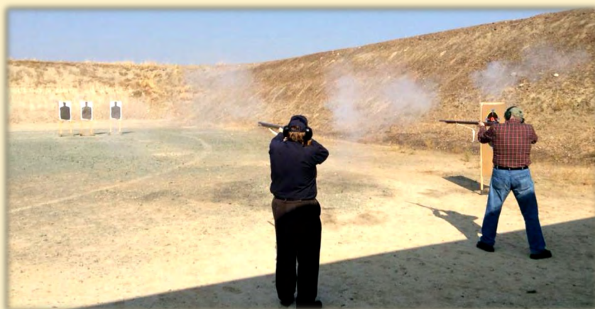
Black Powder Firearms firing