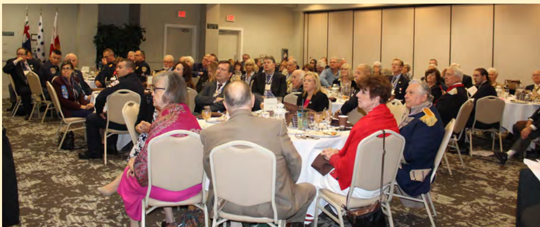
Public Service Luncheon Attendees