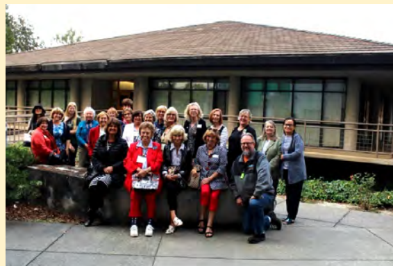
The Sake Tour

In December, I accompanied the CASSAR President to the Wreaths Across America event in Dixon, CA. We also attended a few chapter meetings and I spoke a little on LACASSAR. A few chapters donated money to our cause and a special thank you to Thomas Jefferson and the Sacramento chapters for their kind donations to our group. We appreciate donations to our group.