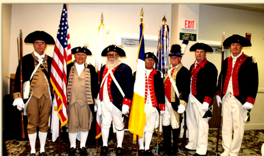
The CASSAR Color Guard