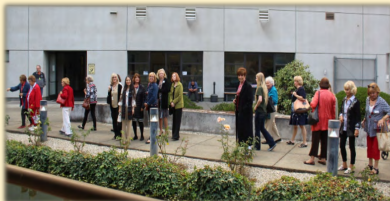
Ladies Auxiliary at the Gekkeikan Sake Brewery