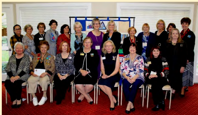
The Attendees at the November State meeting.