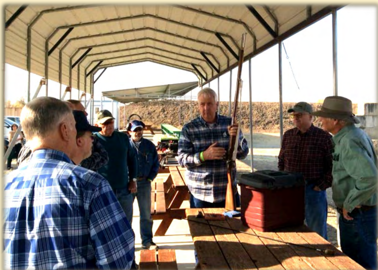
Sacramento Valley Shooting Center: