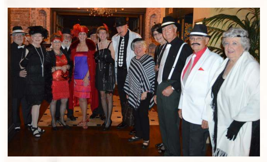
Speakeasy Revelers in lineup