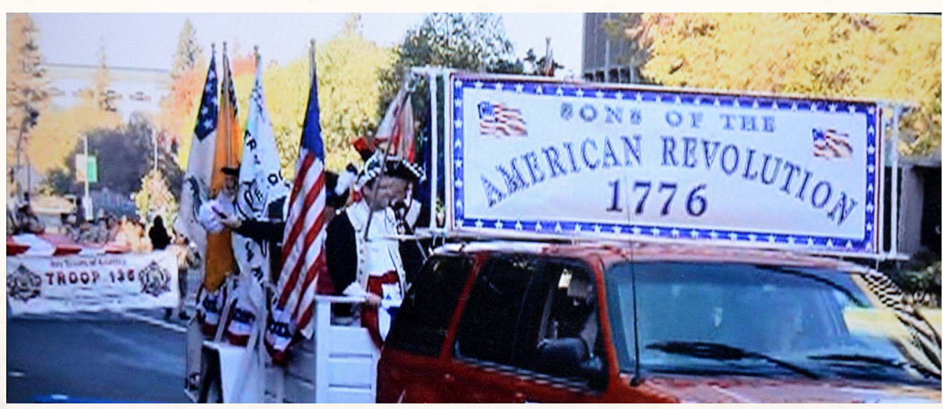
Sacramento Chapter in the Sacramento Veterans Day Parade