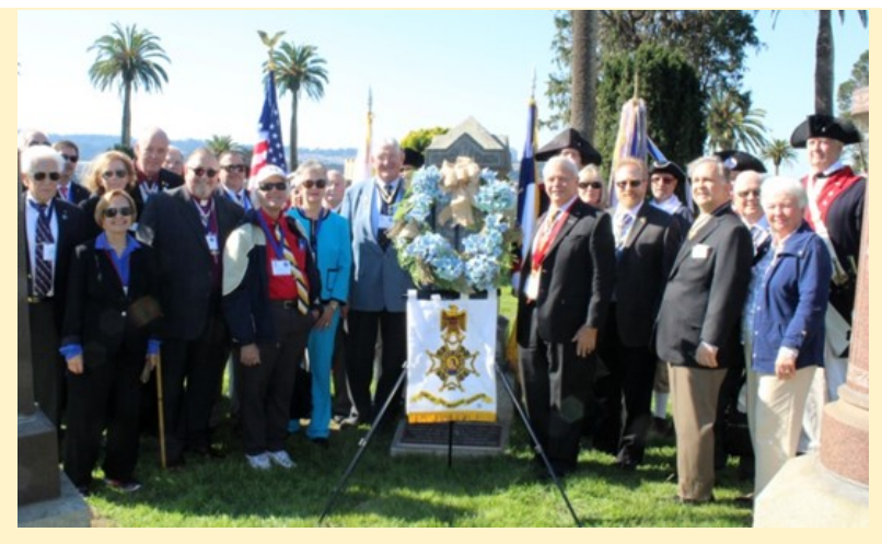
Members of the CASSAR and Ladies Auxiliary.