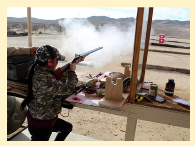
Un Hui Yi