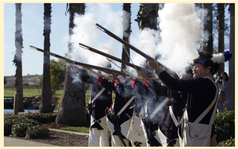
A California, SAR Color Guardsmen - Firing Team fires a 21-gun salute.