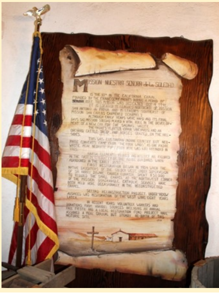
Photo on right: a history of Mission Nuestra Señora de la Soledad positioned near the United States flag.