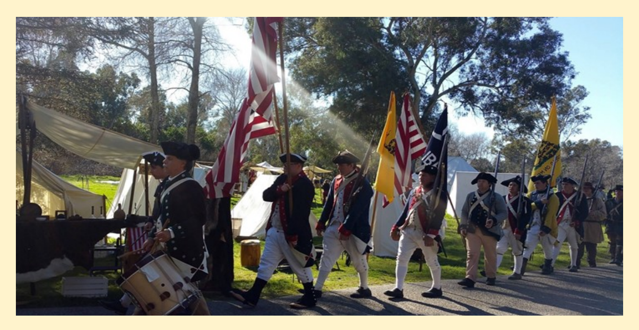
The Continentals return from the battlefield.