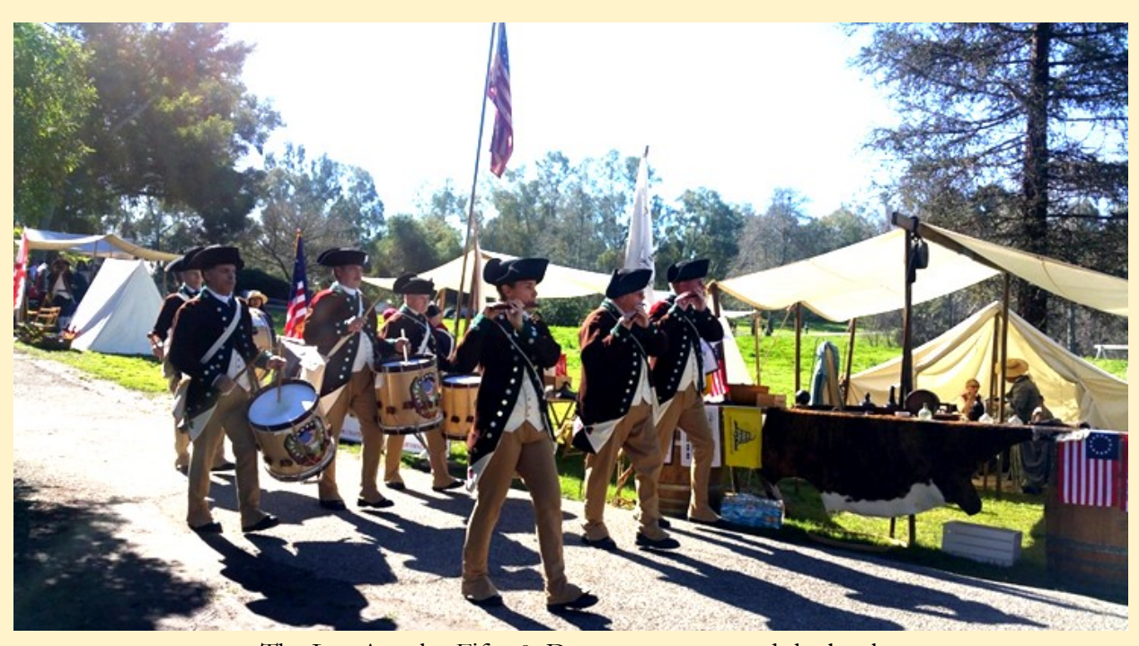
The Los Angeles Fifes & Drums move toward the battle.