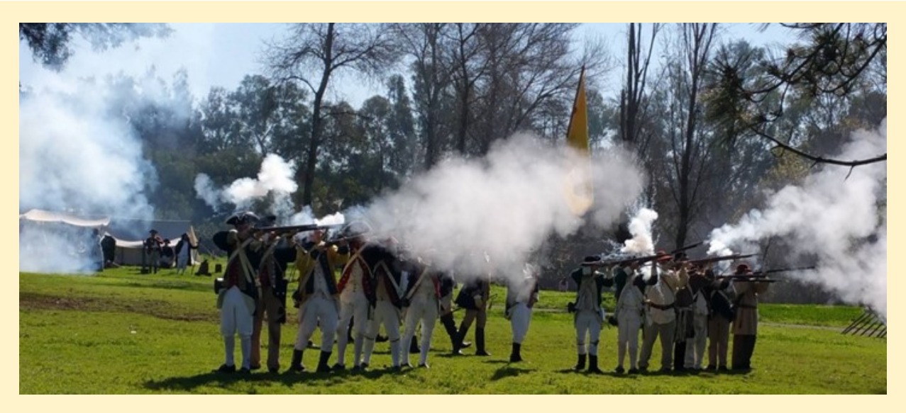
The Continentals and British engage one another