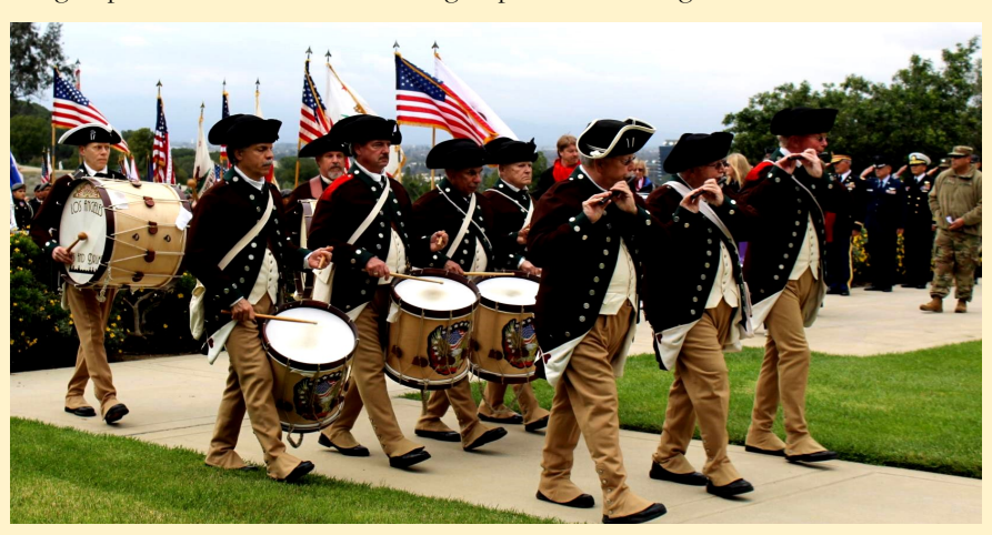
Los Angeles Fifes & Drums