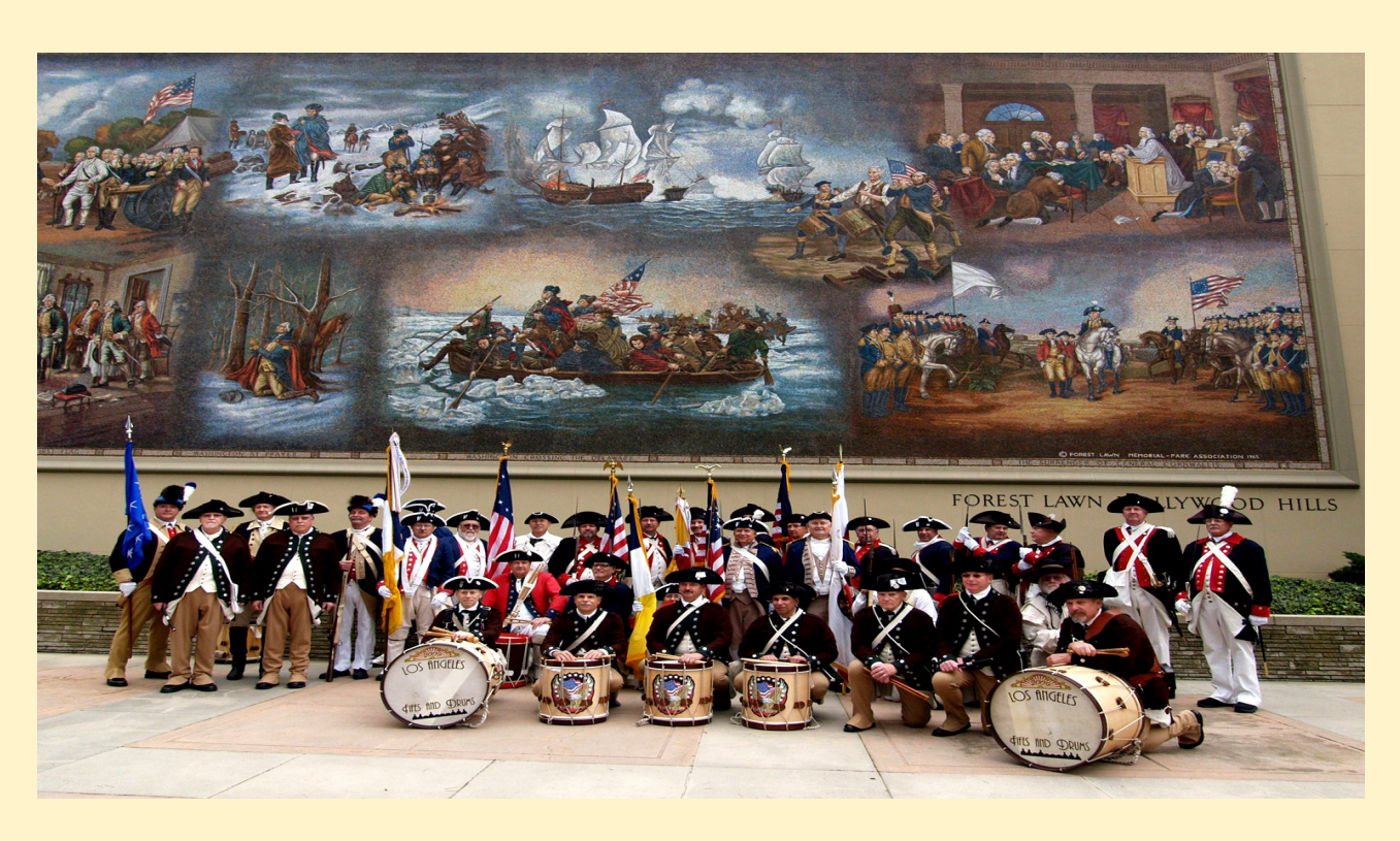
CA Society SAR Color Guard and the Los Angeles Fifes & Drums