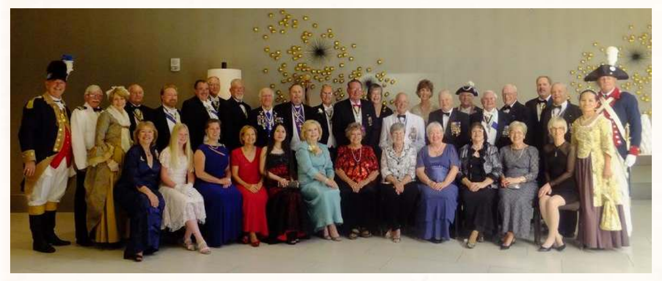
CASSAR members at 2014 national Congress