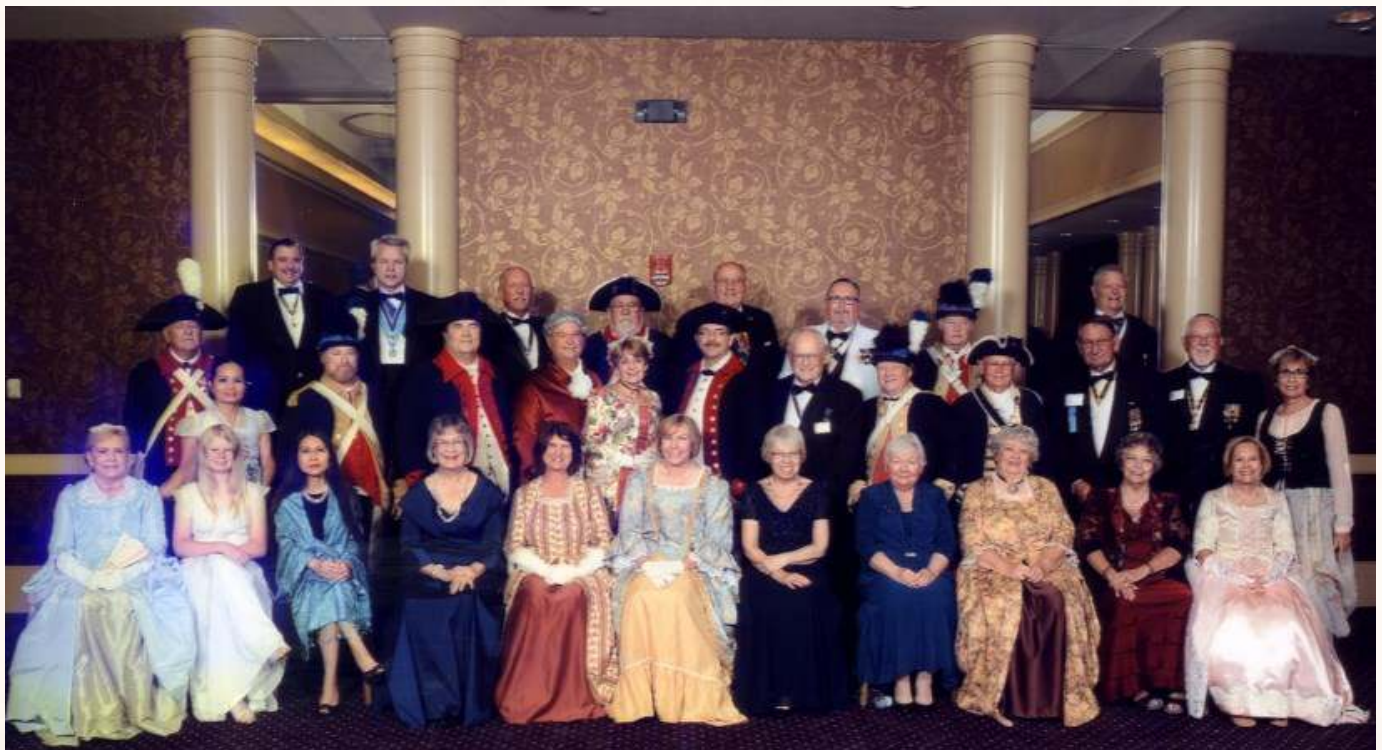
CASSAR Members Dressed for the Tuesday Night Banquet at the 125th Annual Congress in Louisville