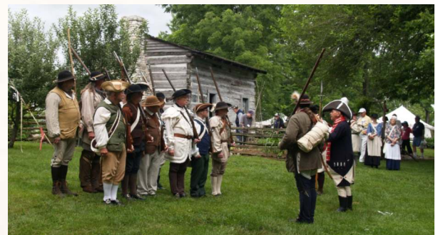
Musket Firing demonstration at George Rogers Clark homesite