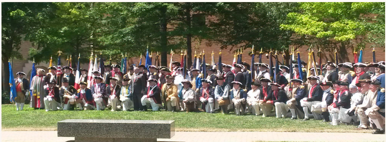
NSSAR Memorial Color Guard