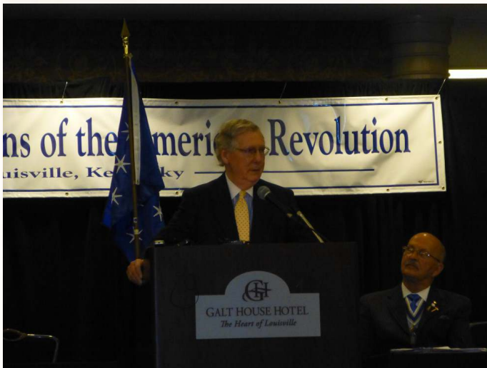
U.S. Senator & Compatriot Mitch McConnell addressing the 125th SAR Congress

that the people want gridlock, but rather they want both parties to check the radicals in each party and come together to pass legislation that both parties can agree on. He also spoke about the controversial plan of the US Treasury Department to replace Alexander Hamilton on the $10 bill. He said of all the people depicted on US currency, Alexander Hamilton is the last person who should be removed. Hamilton was a strong promoter of the US Constitution, the Secretary of the Treasury, and the financial architect of the George Washington Administration.