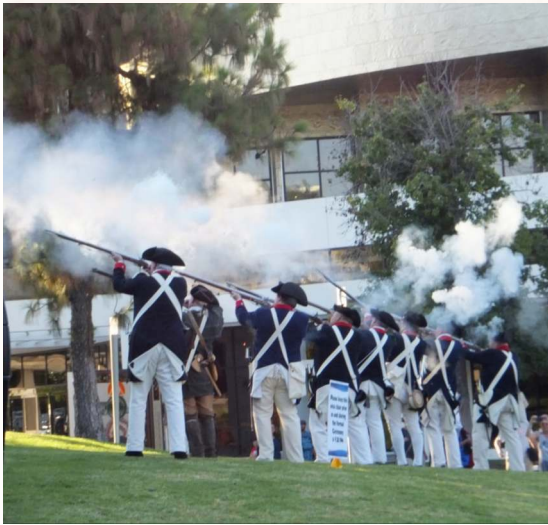
CASSAR Color Guard Fires a volley at Let Freedom Ring