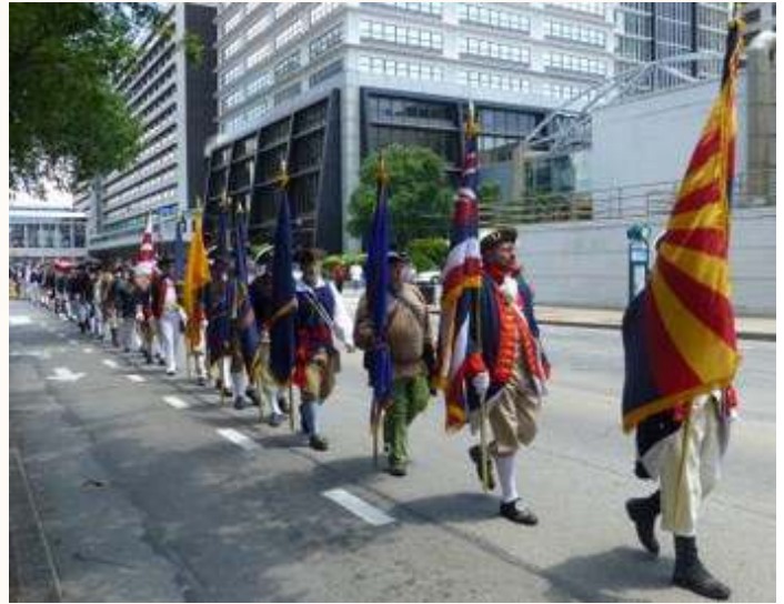
NSSAR Memorial Color Guard in Procession to Cathedral