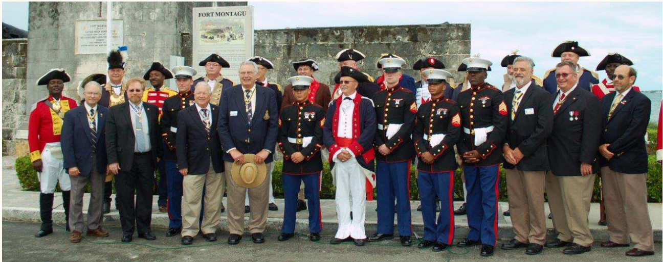
SAR Ceremony at Fort Montagu, Bahamas, honoring first U.S. Marine landing on foreign soil, March, 1776

May 19 we anchored at Coco Cay, a private island leased by Royal Caribbean. We enjoyed nature walks, water sports, and great food, departing that evening for the return voyage to Baltimore, spending May 20 and 21 at sea.