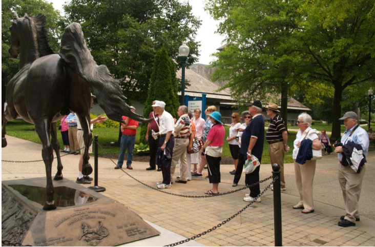
NSSAR Members visit to Kentucky Horse Park