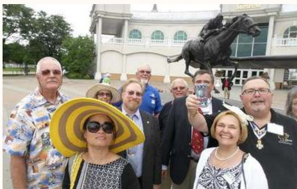
CASSAR heading to Churchill Downs Museum