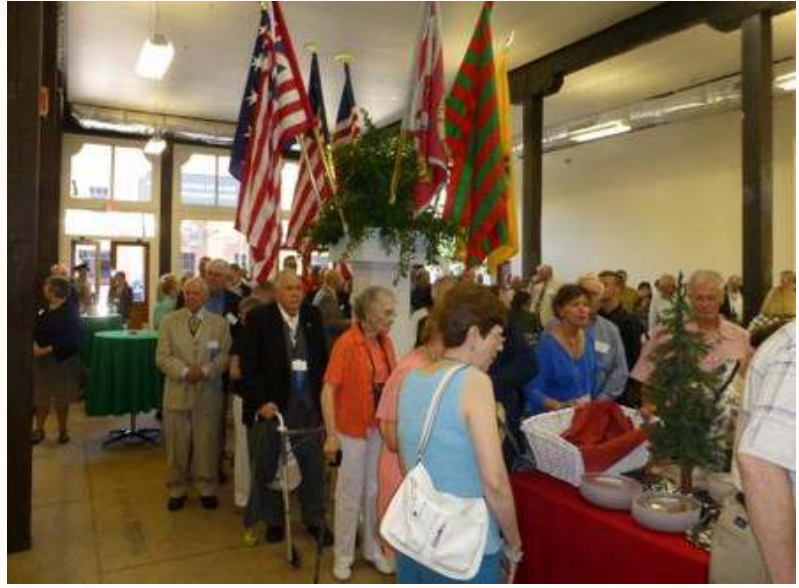
Host Reception at National Headquarters

That evening, we attended the Host Society Reception at the SAR Headquarters Building on West Main Street. The Reception was on the ground floor, with food and Michter's whiskey. The Michter's company has purchased the building adjacent to our headquarters, and once they renovate the building, will move in. Members were encouraged to go the Louisville Science and Technology Museum, where they showed a movie about Kentucky's history.