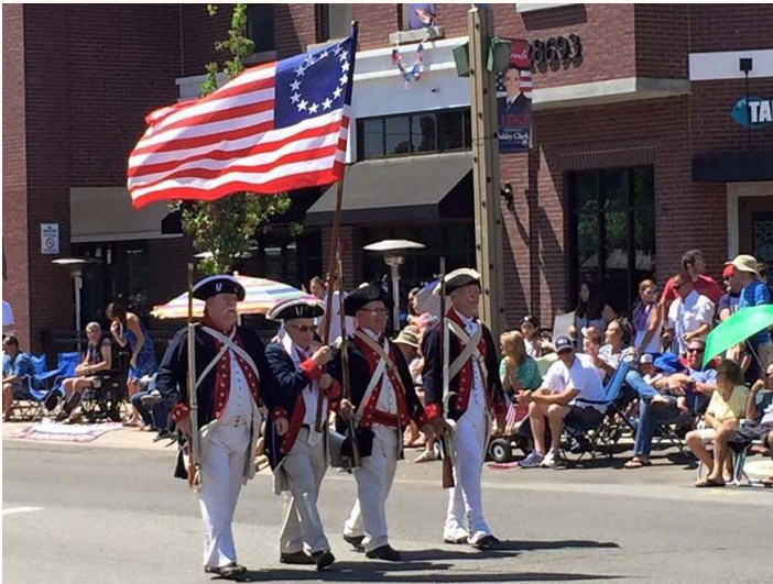
4th of July Parade Temecula, California