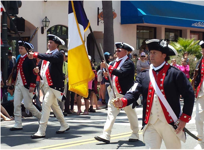
CASSAR's newest Color Guard Santa Barbara 4th of July Parade