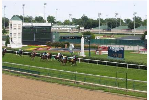
The SAR Race at Churchill Downs