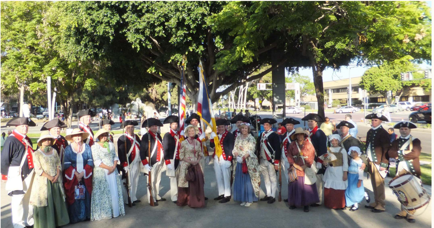
CASSAR Color Guard and Ladies Auxiliary at Let Freedom Ring Event