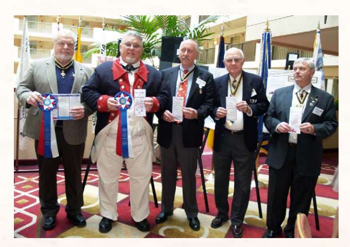
Brochure contest winners