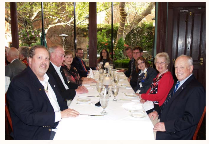
Gold Country and Mother Lode Chapters enjoy Friday dinner