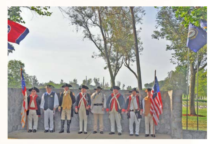
Riverside Chapter Guardsmen at the Riverside National Cemetery.

On May 27, 2013, members of the Riverside Chapter, CASSAR gathered at the amphitheater adjacent to the Medal of Honor monument at the Riverside National Cemetery to render honors to those fallen in defense of our nation. As the name of each war since our national inception was read, the number of fallen warriors was given, a bell was rung, and a musket salute was fired. This ceremony has been performed for the last ten years by the Riverside Chapter. Members of other lineage groups were in attendance including representatives of the Aurantia Chapter DAR, the Luiseno Chapter DAR, the Order of Founders and Patriots, and the DeAnza Chapter of CAR. Days earlier, Riverside Chapter CASSAR members assisted in placing American flags on graves in the National Cemetery.