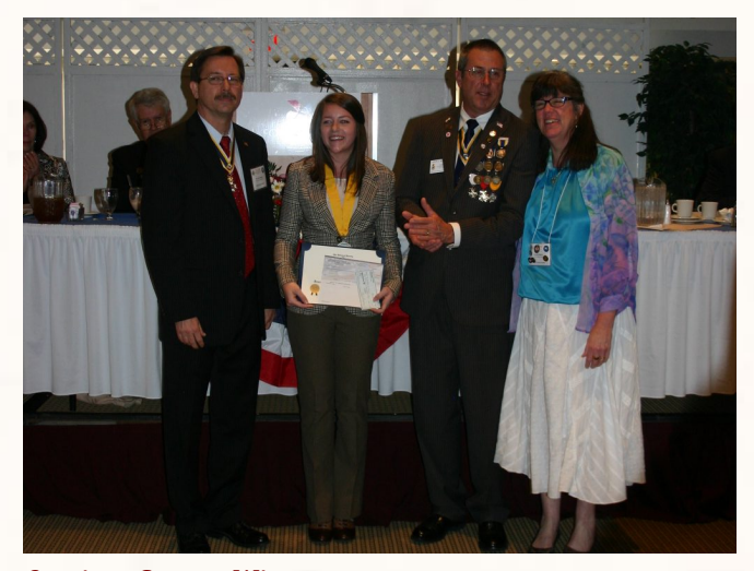
Orations Contest Winner

1812. Key's poem was set to the Anacreonic Song music, and it became the Star Spangled Banner and Compatriot President Herbert Hoover signed a congressional resolution in 1931 to make the Star Spangled Banner the national anthem.