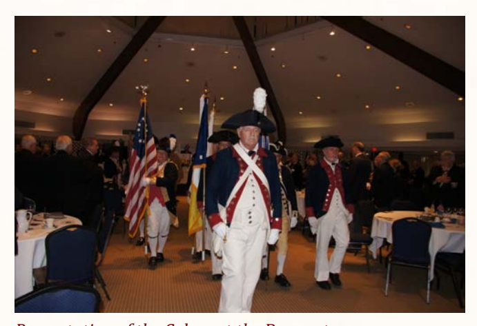
Presentation of the Colors at the Banquet