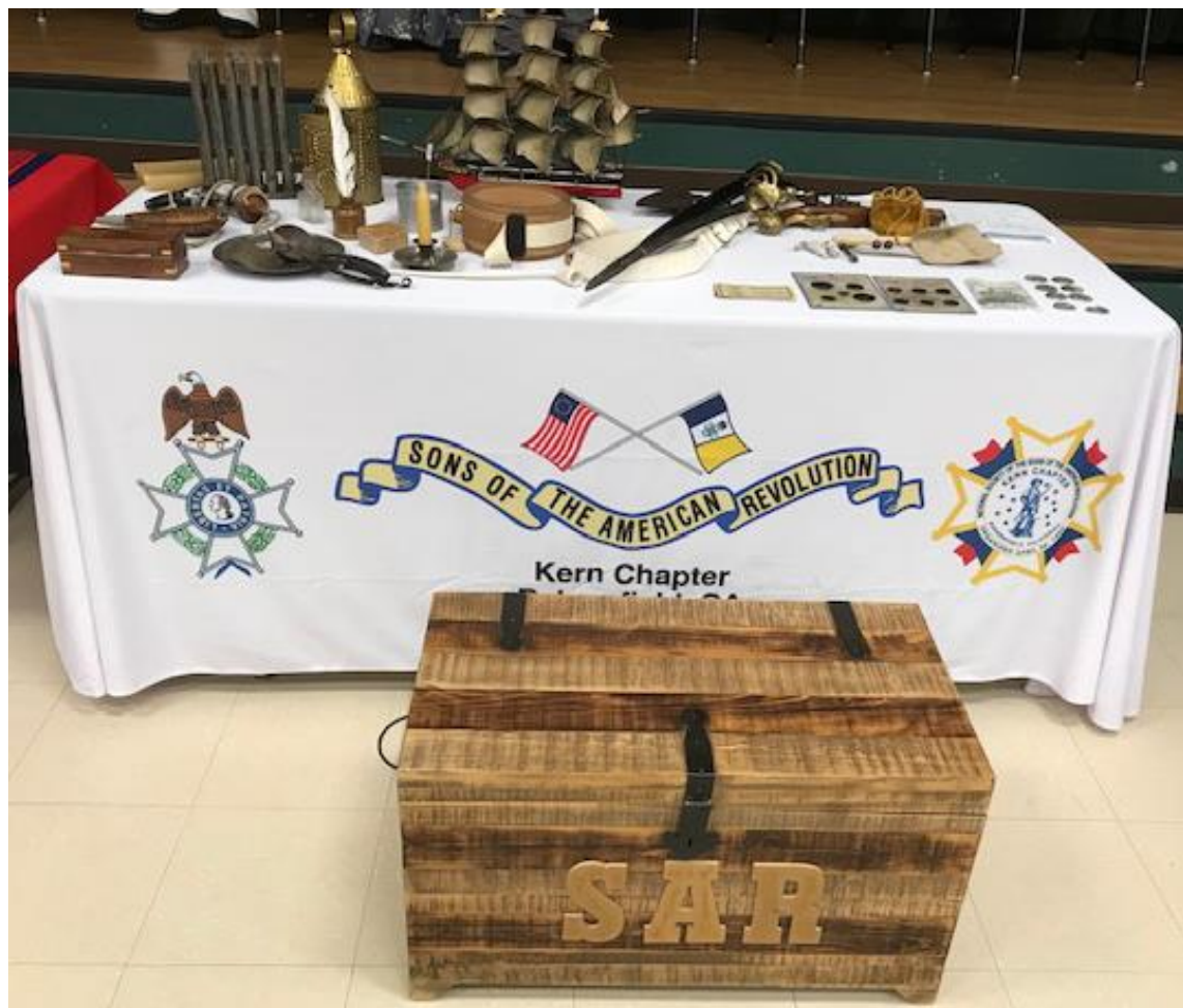
Kern Chapter Chest and its artifacts