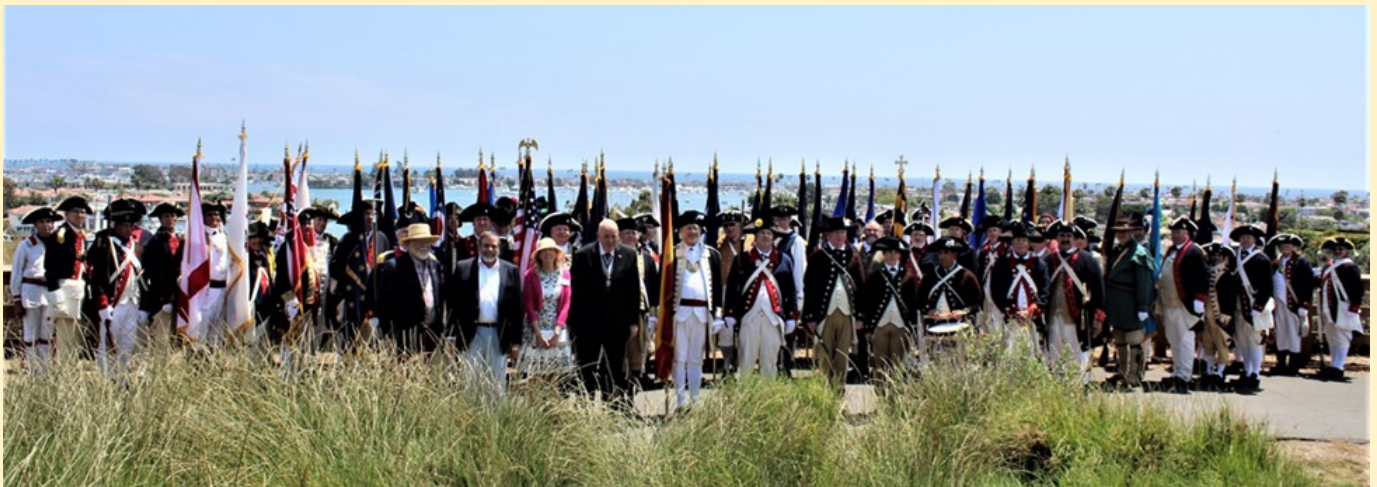
Color guard group photo at Castaways Park, Newport Beach, CA