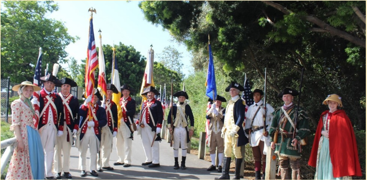
Orange County Chapter (CA) Lee's Legion Color Guardsmen and friends.