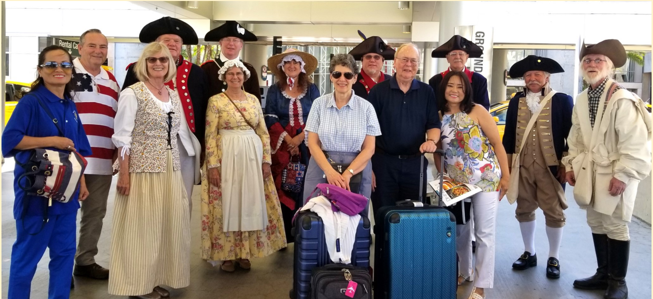
Hilton Hotel - CASSAR Color Guardsmen and LAUX members