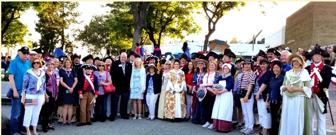
SAR Group Photo