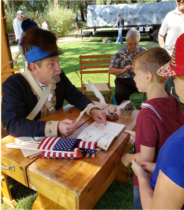
Redlands Chapter completed enlistment papers for 200 of those who visited our "Sons of the American Revolution" encampment! (Note: Children's photos blurred on purpose.)