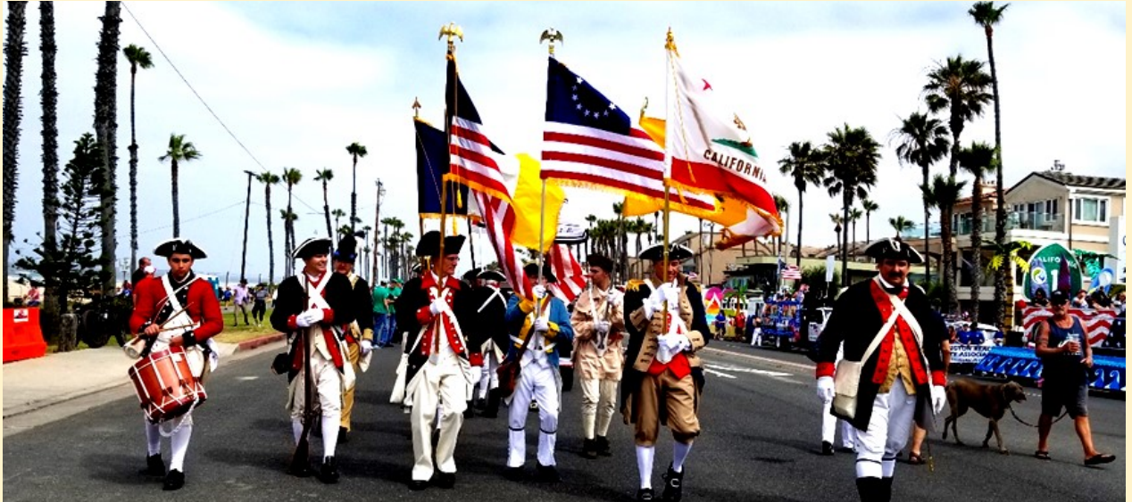
Main Street gets narrow with all the popups and crowd.

The largest Independence Day parade west of the Mississippi River features entries including bands, floats, local dignitaries, equestrian groups, film and television celebrities and community groups. It has been held since 1904.