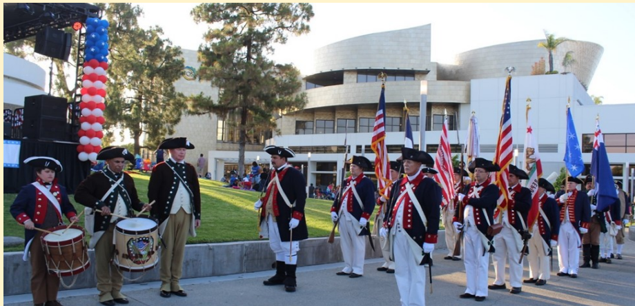
Color Guardsmen (compatriots) from at least 10 states participated in the program. We were also joined by members of the Los Angeles Fifes and Drums.