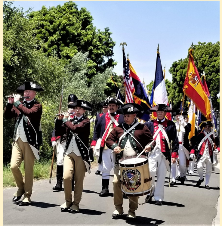
Color Guard on parade at Castaways Park lead by members of the Los Angeles Fifes and Drums.