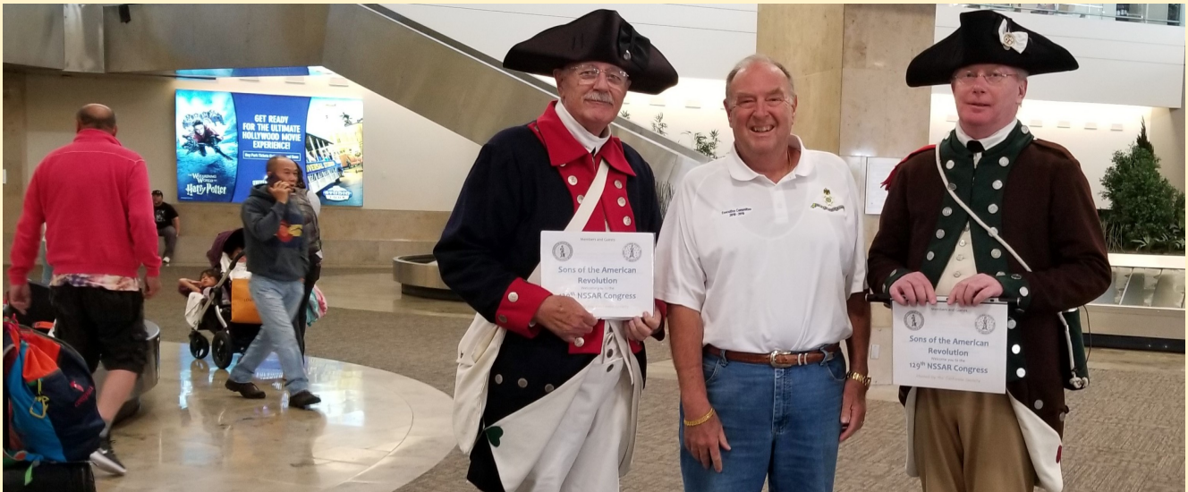
John Wayne Airport Congress Greeters