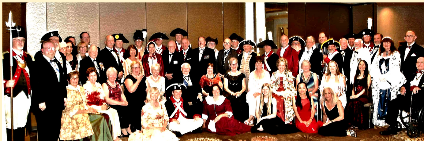
The California Contingent attending the NSSAR 2019 Annual Congress