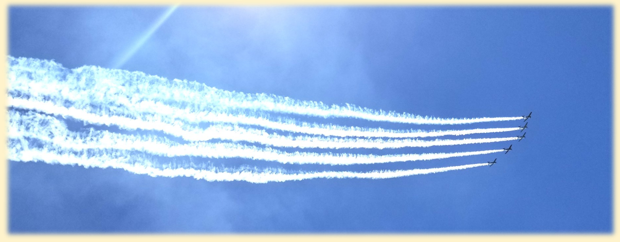
Fly over by the Tiger Squadron from Torrance, CA.