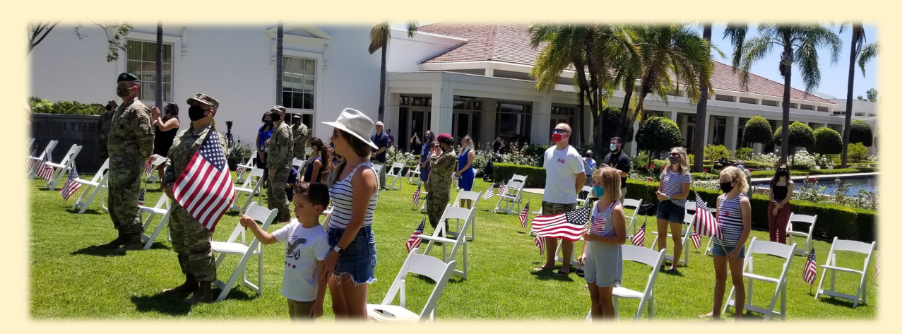
The attendees social distancing.