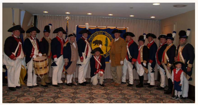
CASSAR Color Guard