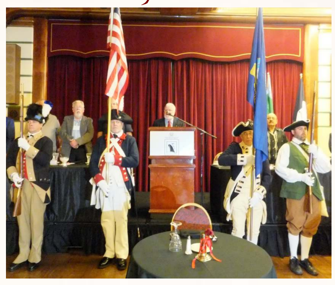
Presentation of the Colors for the USS Bennington reunion