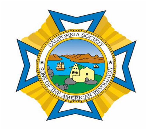
Dual State Membership

National has a form 0920 which is meant for members that desire to be a "Dual" member in another state to fill out each year and file with the State Secretary.