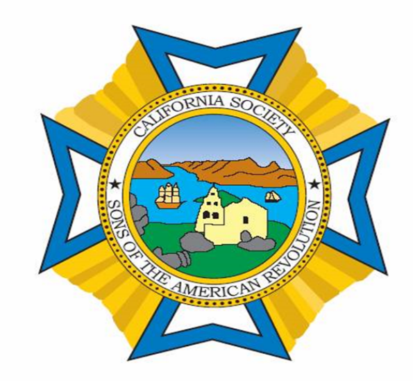
Application to Reinstate Membership into the California Society