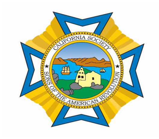
Chapter to Chapter Transfers

Many members have decided to transfer their membership from their original chapter to another chapter, with out informing the the original chapter.