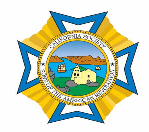
Dual State Membership

Chapters should request that their Dual State member provide the state with this Form, there are a few exceptions, when the dual member is also a California State Life Members.