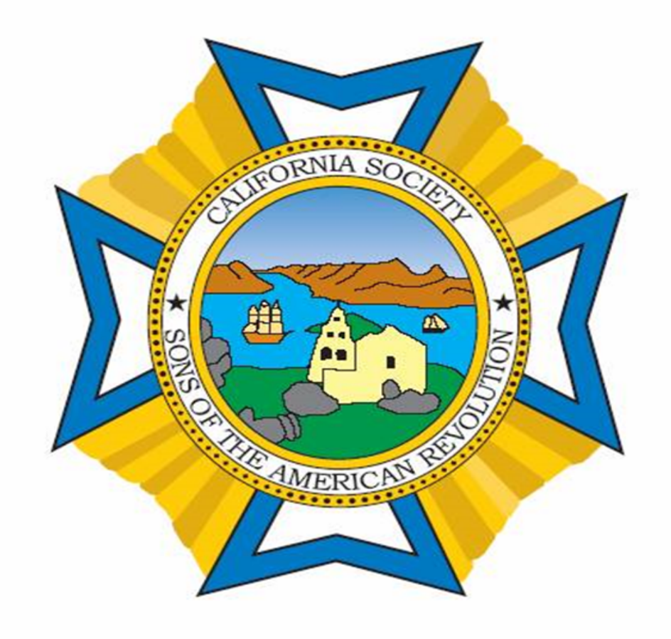
California Society Secretary Forum Transfers, Dual Members, & Reinstatements November 18, 2020